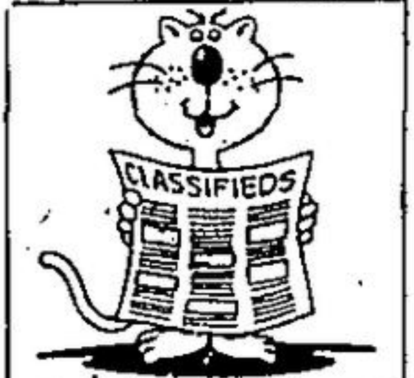
Be A Cool Cat And Check Out the Savings in the Classified Section.

Substitutes for coffee have included roasted and ground chicory roots, asparagus seeds, dandelion roots, English oak acorns, hawthorn seeds, kava-kava, milk thistle seeds, soybeans, witch grass roots and sweet potatoes.