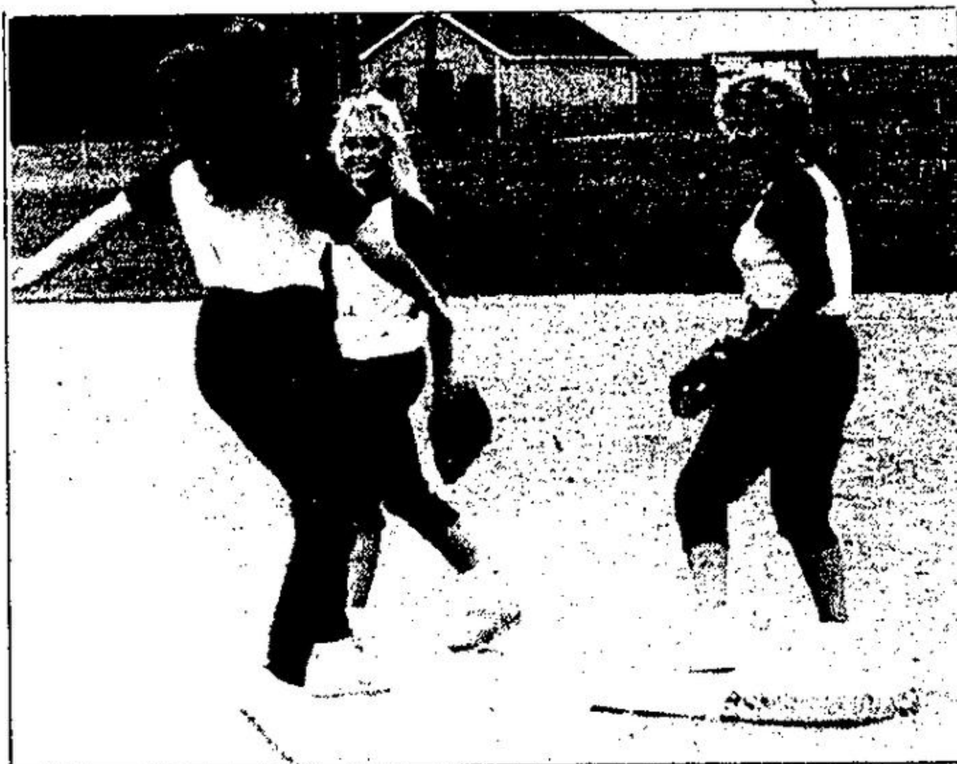
Action around first base during a Ladies Powderpuff Softball League game between Raisin Hill and Blue Zone at the Fairgrounds. Raisin Hill topped Blue Zone by a lopsided score. League games continue Monday, Wednesday and Friday nights at the Fairgrounds.