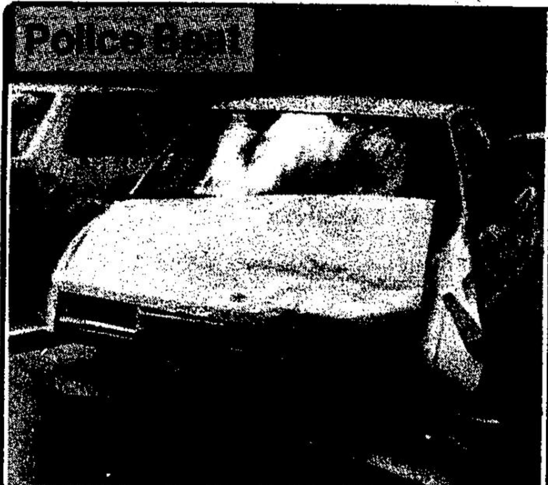
This 1989 Dodge was one of two vehicles involved in a two-car collision at the corner of Guelph Street and Maple Avenue in Georgetown July 14. No one was injured in the incident. Halton Regional Police laid charges of making an improper turn following the accident.