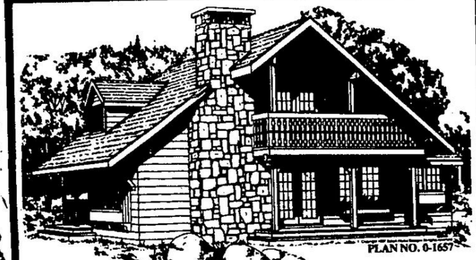
LEISURE HOME BOASTS VAULTED CEILING

Country charm with all the conveniences for easy living make this cottage an ideal second home. Sure-to-please features include french doors, wide window sills, two fireplaces and a private deck.