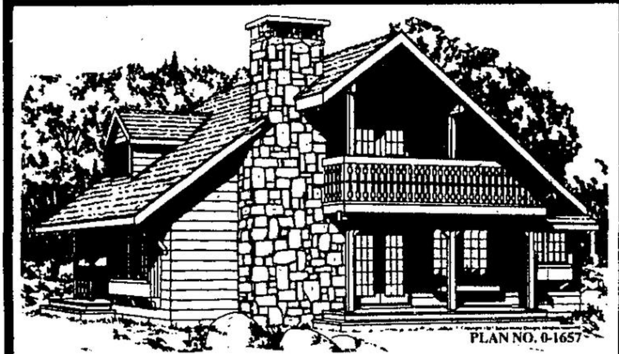
LEISURE HOME BOASTS VAULTED CEILING

Country charm with all the conveniences for easy living make this cottage an ideal second home. Sure-to-please features include french doors, wide window sills, two fireplaces and a private deck.