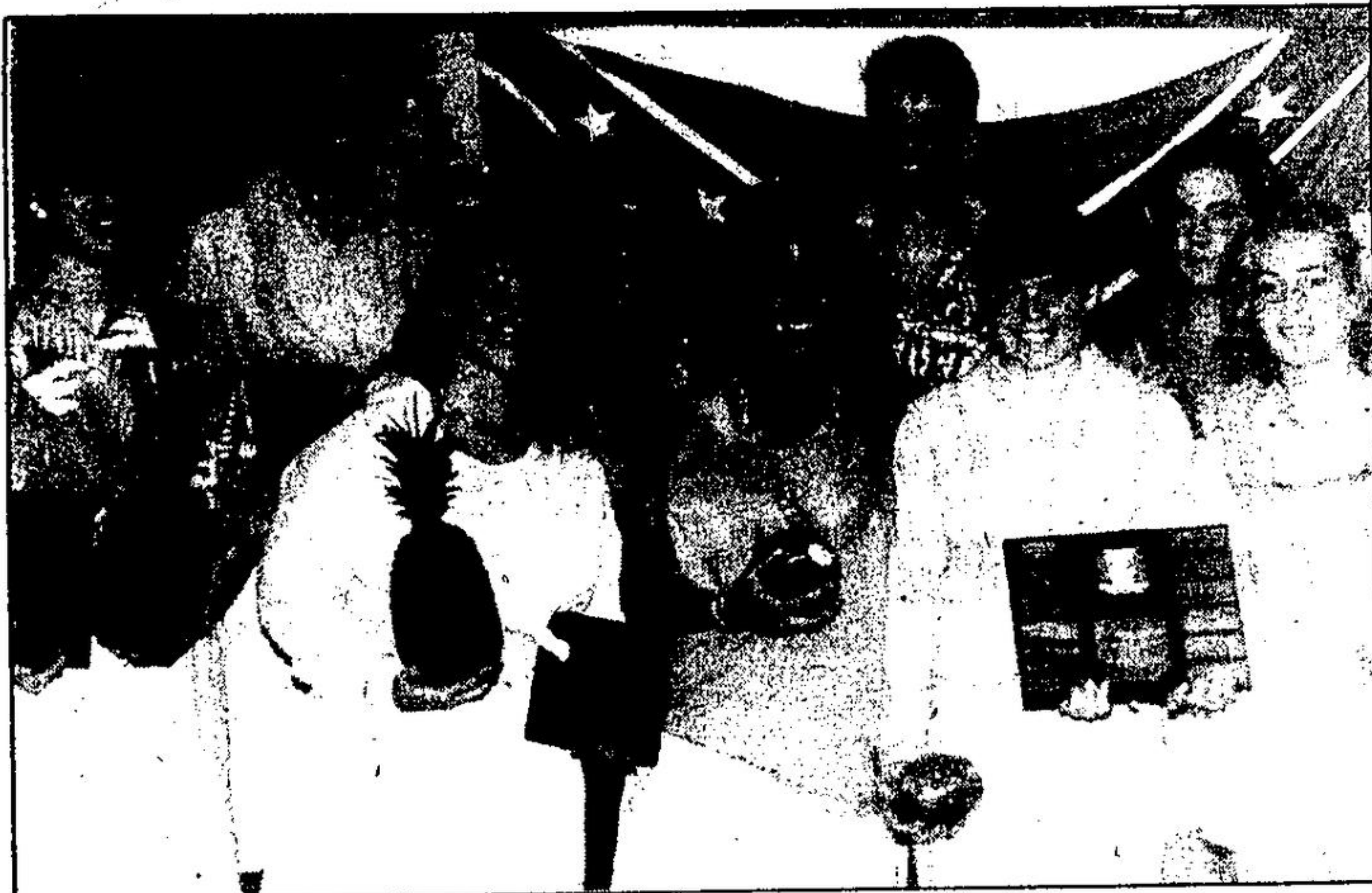
Pineapples and plaques