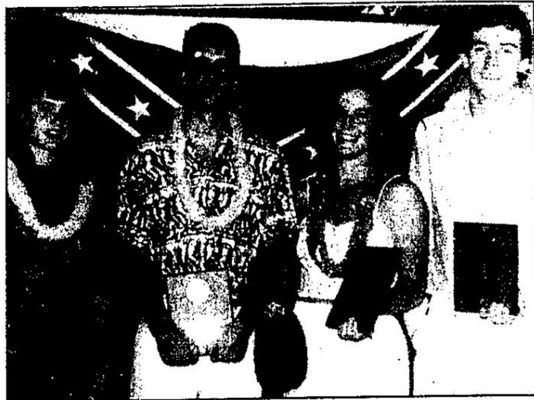
Best of '89