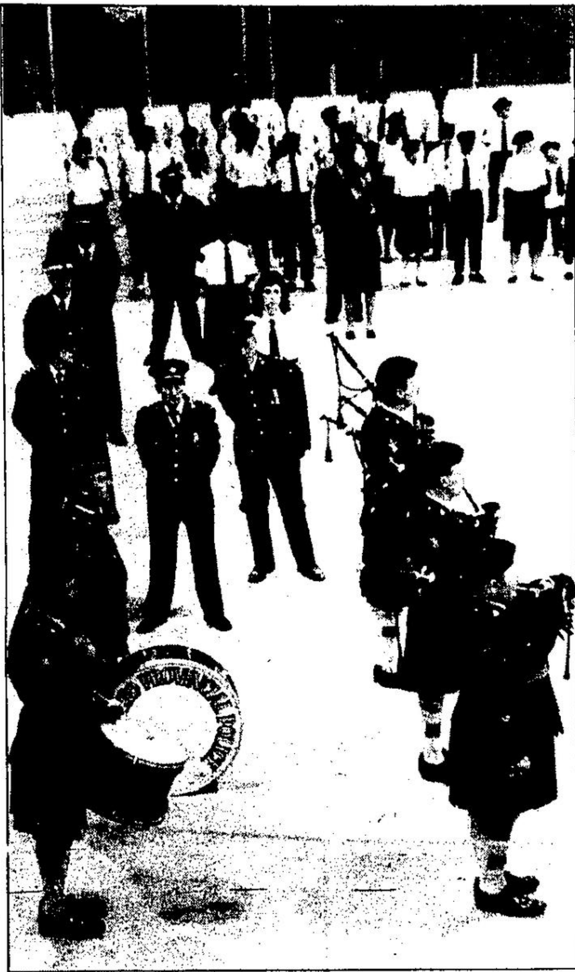
The Ontario Provincial Police marching band was one of the features at the Halton-Peel St. John's Ambulance festivities Friday at Gordon Alcott Arena in Georgetown. Halton Hills was chosen as this year's host for the annual parade.