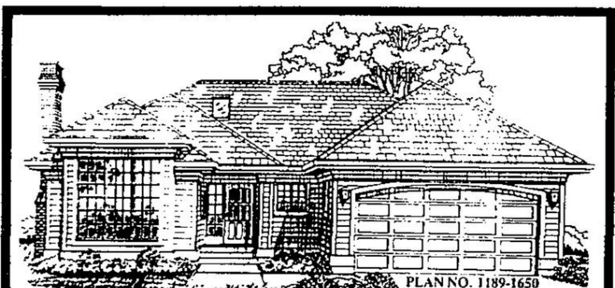
PLAN NO. 1189-1650 EXCITING BUNGALOW OFFERS A CHOICE OF EXTERIORS

Affordable, three-bedroom bungalow may be finished with traditional brick, horizontal siding or stucco (windows and roofings differ with each elevation). The foyer spills to a sunken living room. The living room, with masonry fireplace, is separated from the dining room by a low railing. The informal area of the home revolves around an open plan kitchen, with centre cooking island, breakfast bay and family room. The breakfast bay is surrounded by windows on three sides, creating a sunny eating area. Wide sliding glass doors in the family room open to the garden patio.