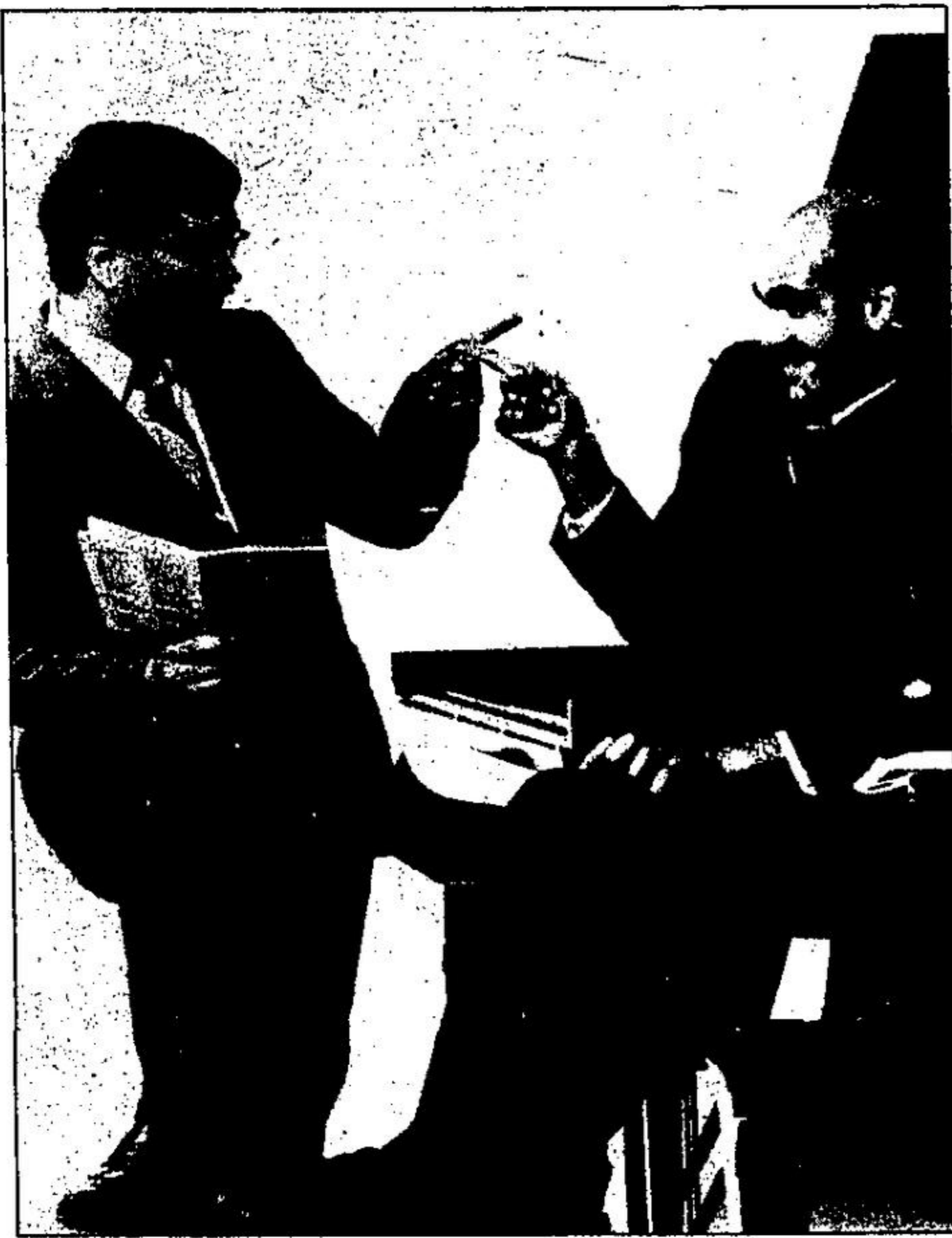
Piano duo coming to town