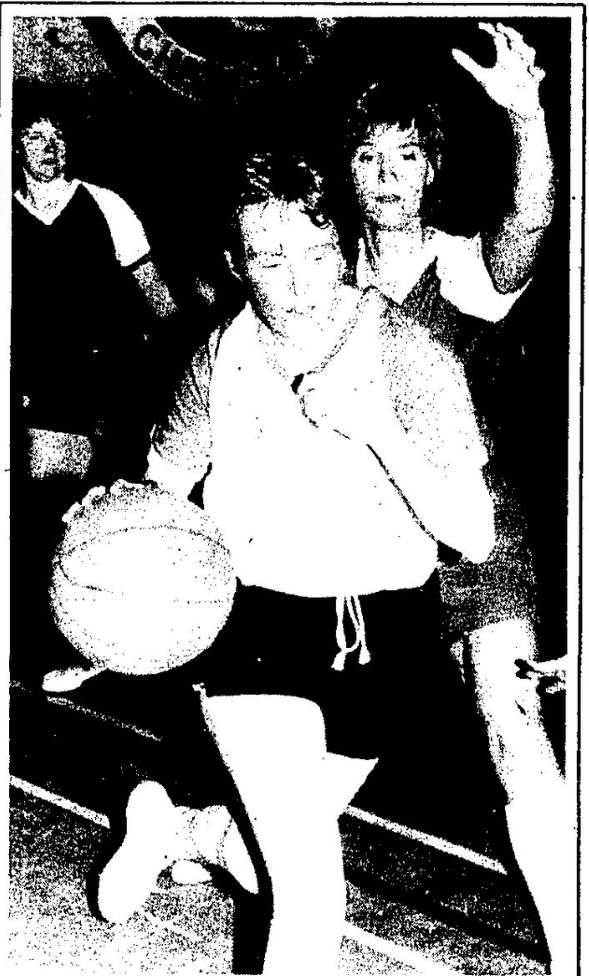
A Pacemaker forward charges toward the basket while a Blue Zone defender attempts to cut off her route during Georgetown Ladies Basketball League championship final action at Centennial School Wednesday. Pacemakers beat the Zone 55-47 to take the top title while the California Raisins defeated the Celts 67-44 in the consolation final.

Registrations are now being accepted for the Tenth Annual Mayor's Road Race to be held Sunday, June 11.