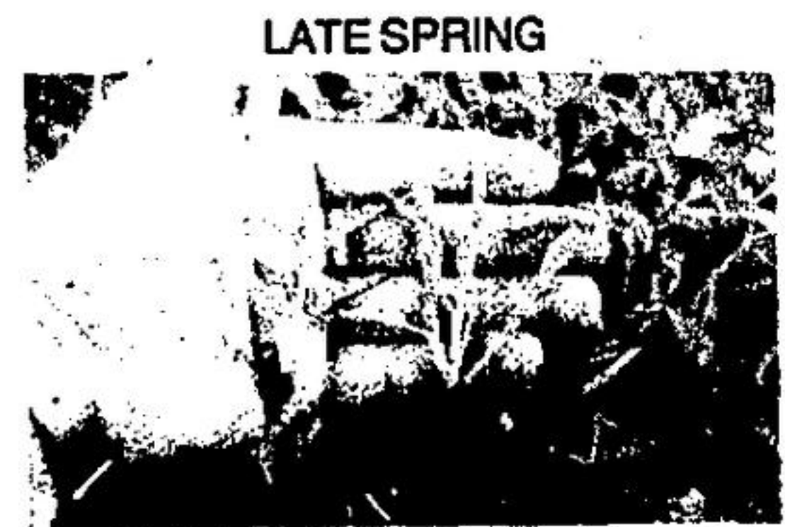
Crabgrass has wide, lime green blades and looks similar to a miniature corn plant.