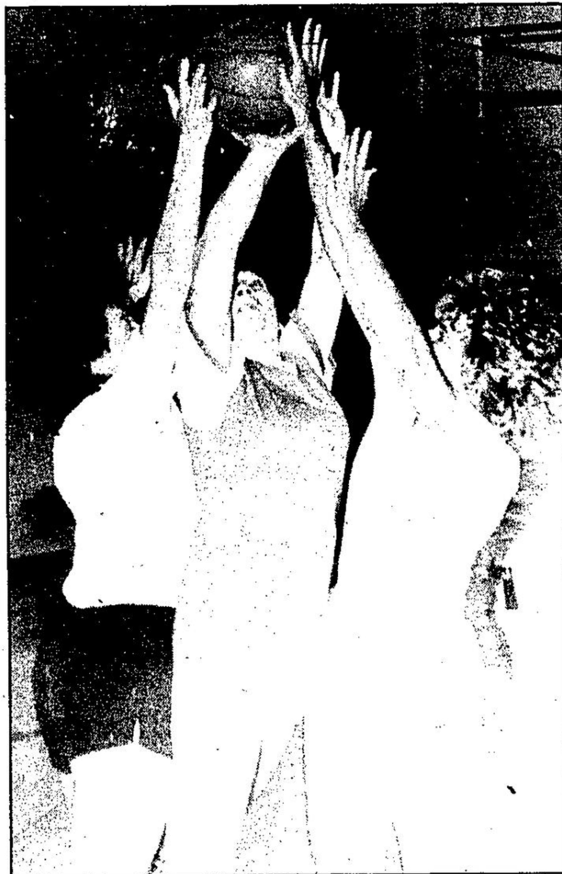
The battle's on

The battle for supremacy in the Georgetown Ladies Basketball League, much like the fight for the ball between GLBL combatants seen in the photo above, takes place May 3 with the 1989 playoff finals. The Blue Zone and the Pacemakers will go head-to-head for the league's championship crown while the California Raisins and the Celtics will tangle in the consolation final. Games start at 7 p.m.