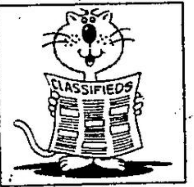
Be A Cool Cat And Check Out the Savings in the Classified Section.

1979 ACADIAN, good condition. $300.00 as is. Call Pat 873-2961(es)