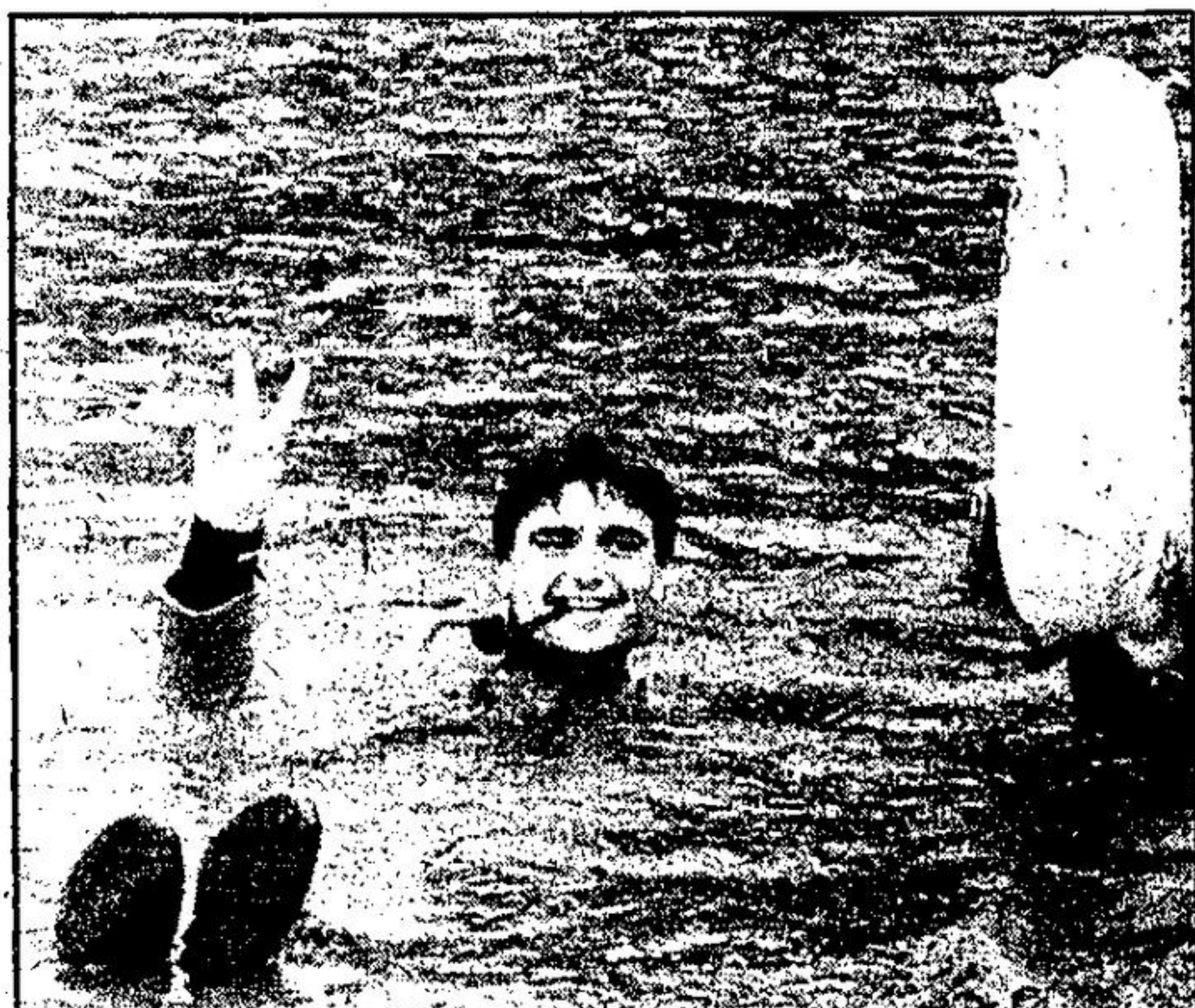
This crazy boater got dumped in all the confusion. The water was still cold as crazy boaters raced down the Credit River Saturday. Anyone have a light?