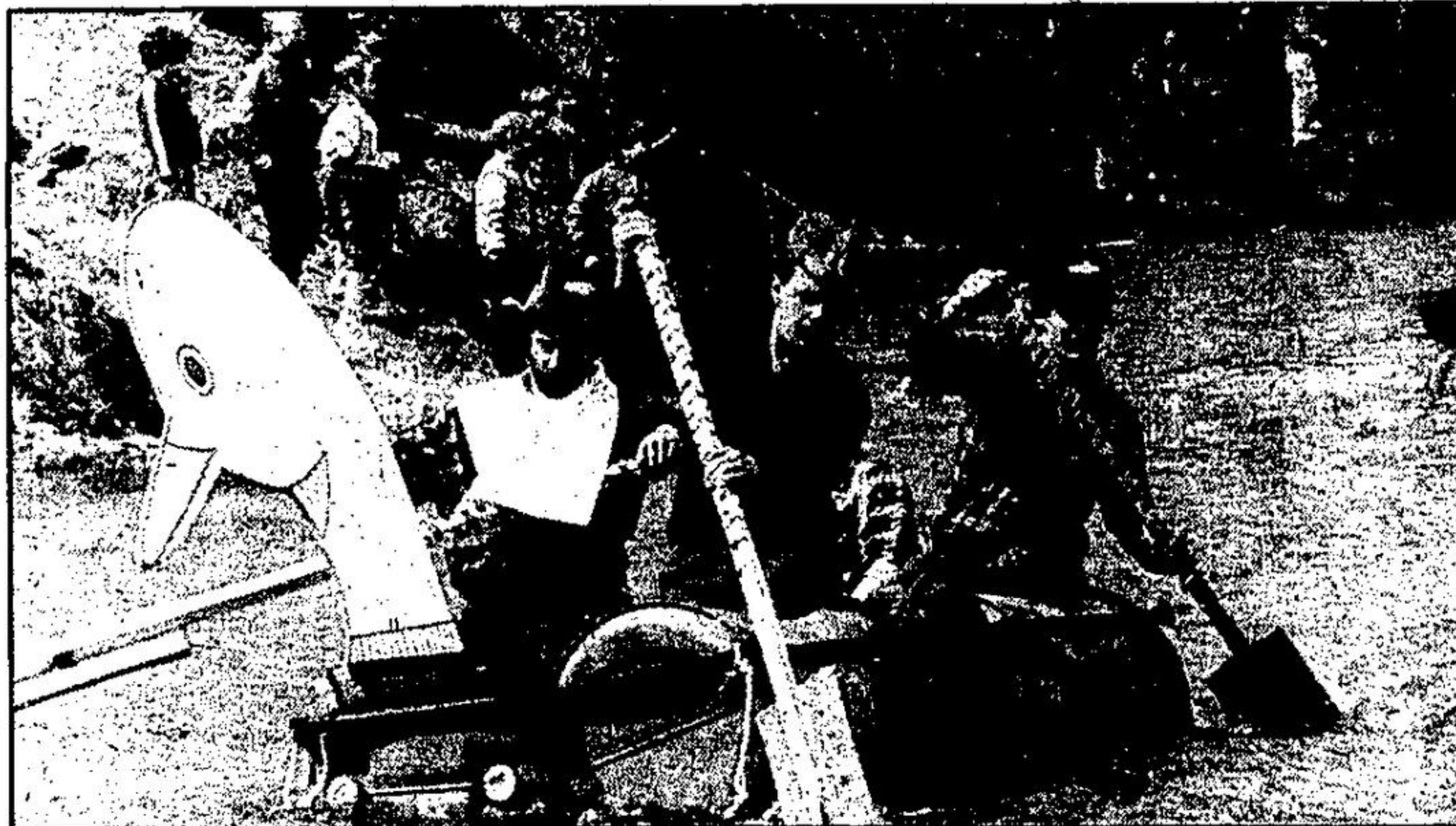
Someone told these boaters to enter the crazy duck race. This fine fowl is one of the 110 entries to the 23rd annual Crazy Boat Race from Cheltenham