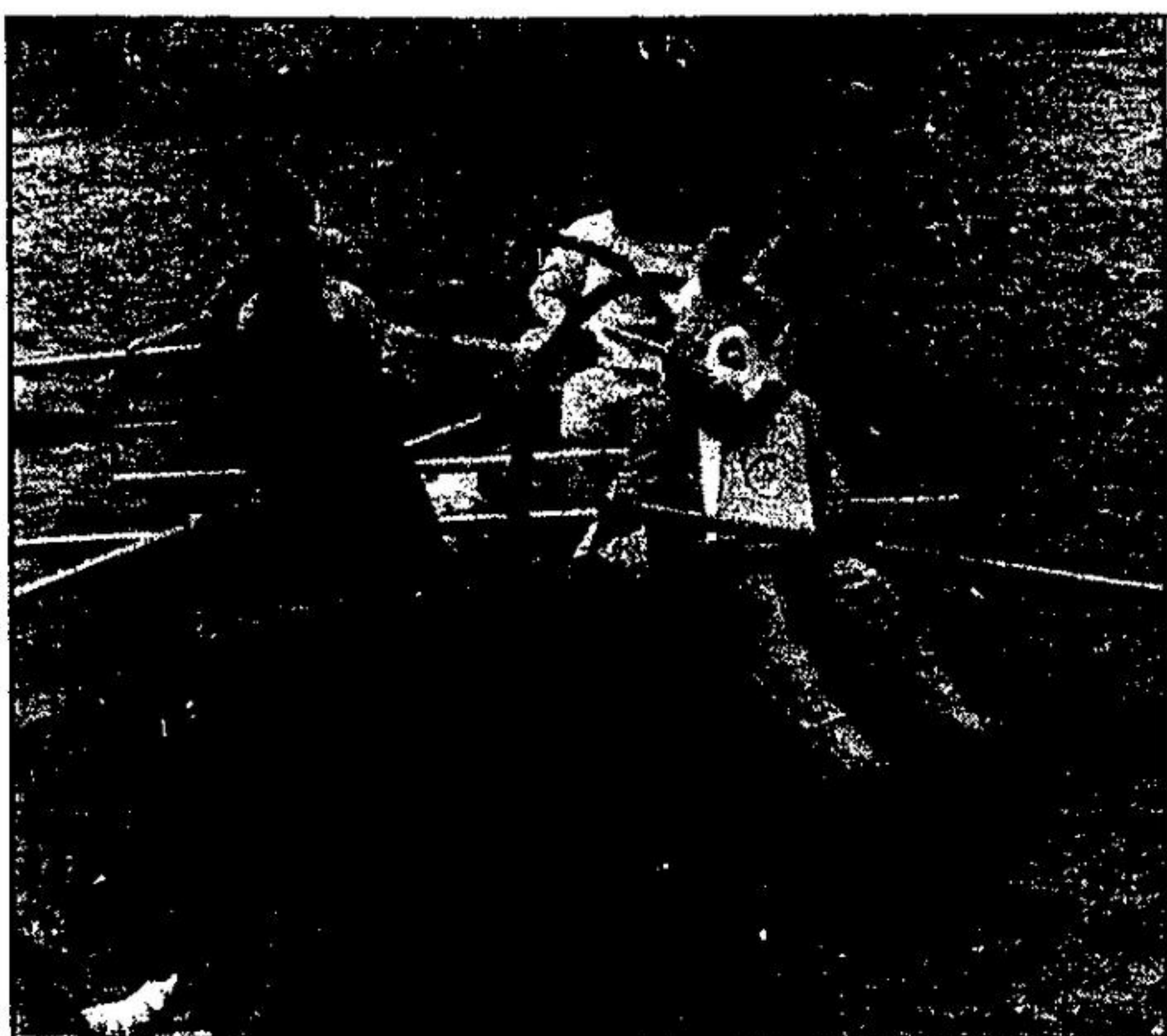
The 23rd Annual Crazy Boat Race sponsored by the Georgetown Lions Club brought out all kinds of entries. Organizers say 110 boats signed up to race down the Credit River Saturday.