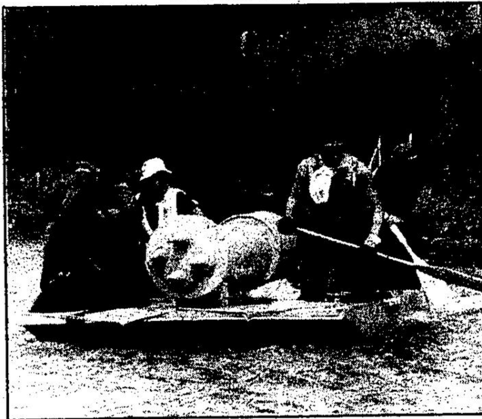
These four guys seem destined to make it to the finish line. The Crazy Boat Race attracted people from all over the north Halton, Caledon and Peel areas. Some boat entrants and fans drove in from the big city to catch a glimpse of the wet and wild annual event.