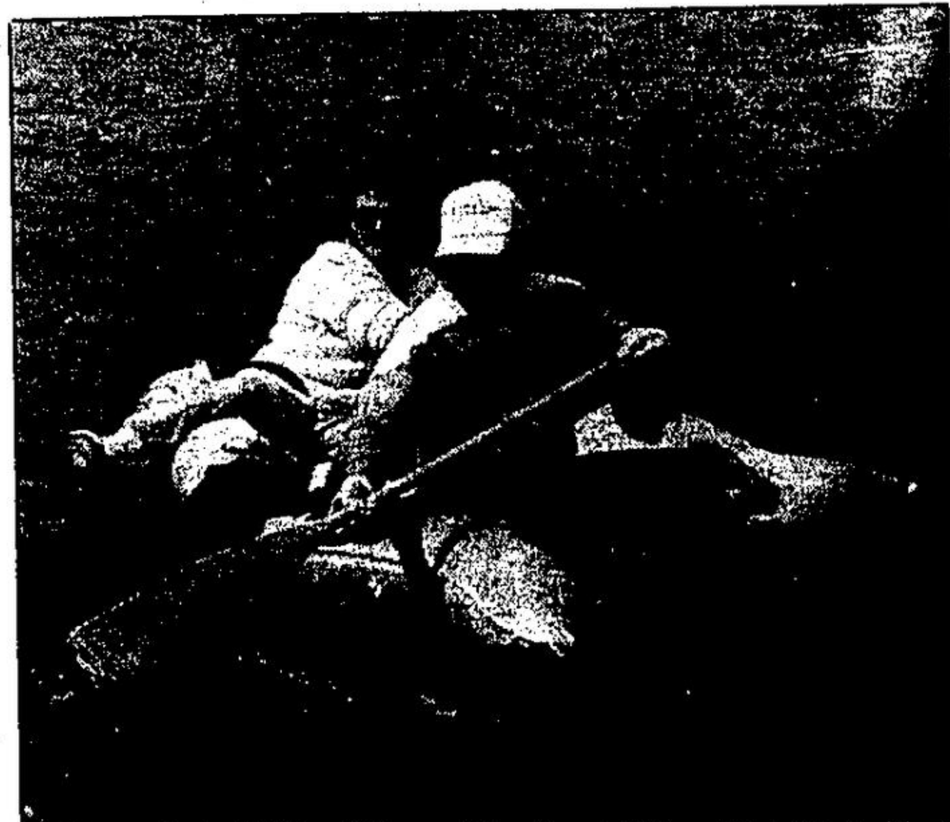
These crazy boat rafters sped toward the finish line at Saturday's race along the Credit River into Glen Williams. This year's race helped raise over $10,000 for multiple sclerosis.