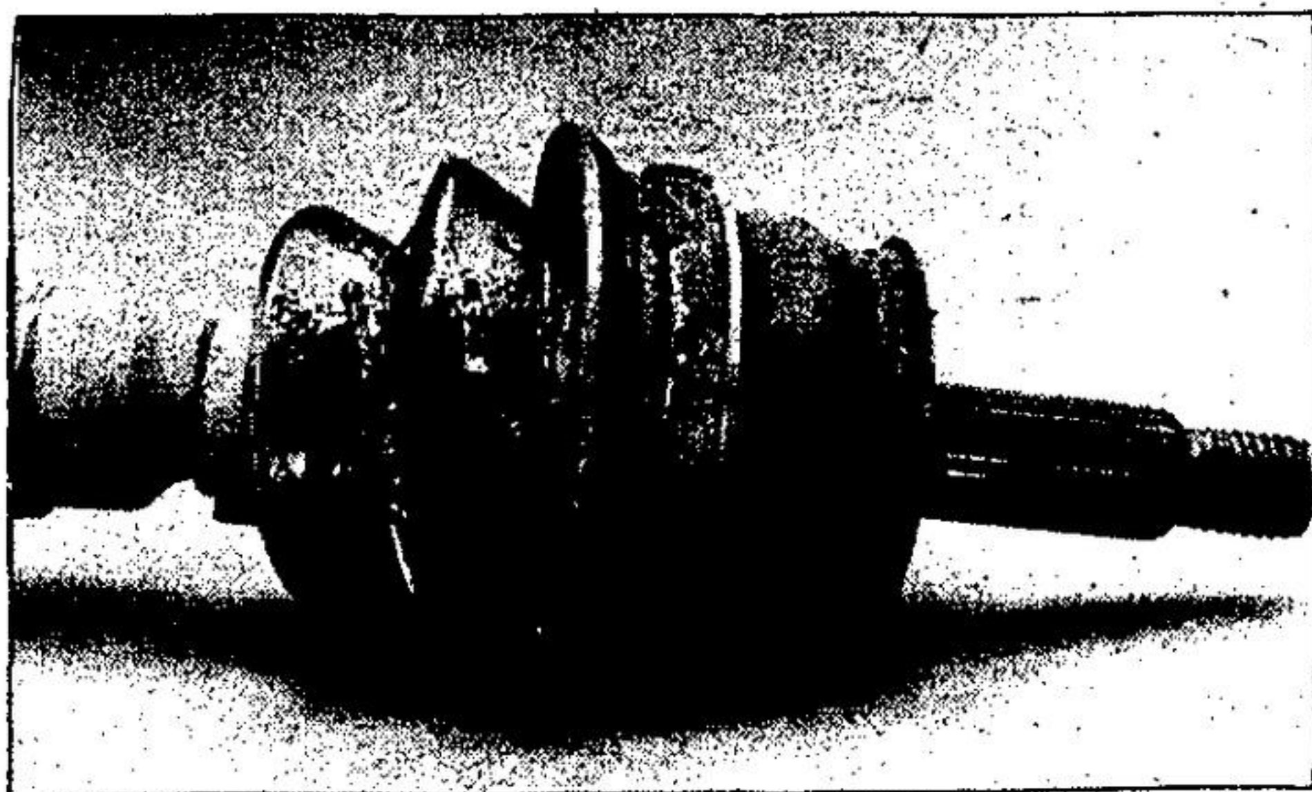
THIS DAMAGED CV BOOT allowed loss of grease and eventual destruction of the CV joint.

If your car is pushing 30 to 40 thousand miles, you may be pushing on a brake pedal that's soft and squishy. You owe it to yourself and to the safety of your family to have a qualified technician check over the master cylinder, brake lines and hoses, calipers and wheel cylinders...plus lining and pads. Car Care Council recommends that, when you need a brake job, you have it done by a qualified mechanic.