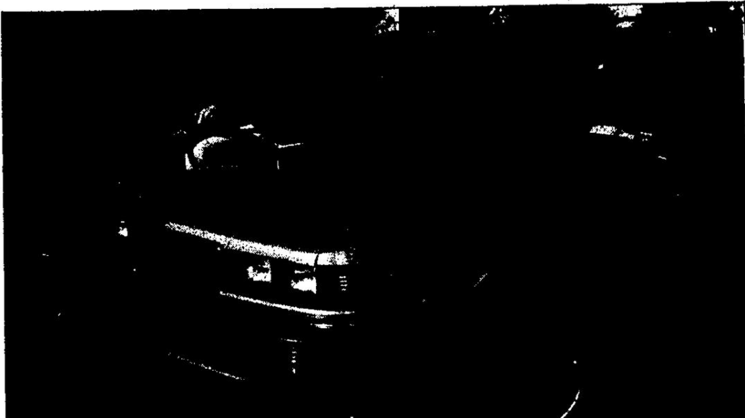
PROPER WASHING AND WAXING retain the showroom shine and increase the resale value of the vehicle.

Keeping your car in the best condition possible with regular checkups is the best way to assure a car's longevity and the best way for you to enjoy a safe, happy spring and summer! SC895493