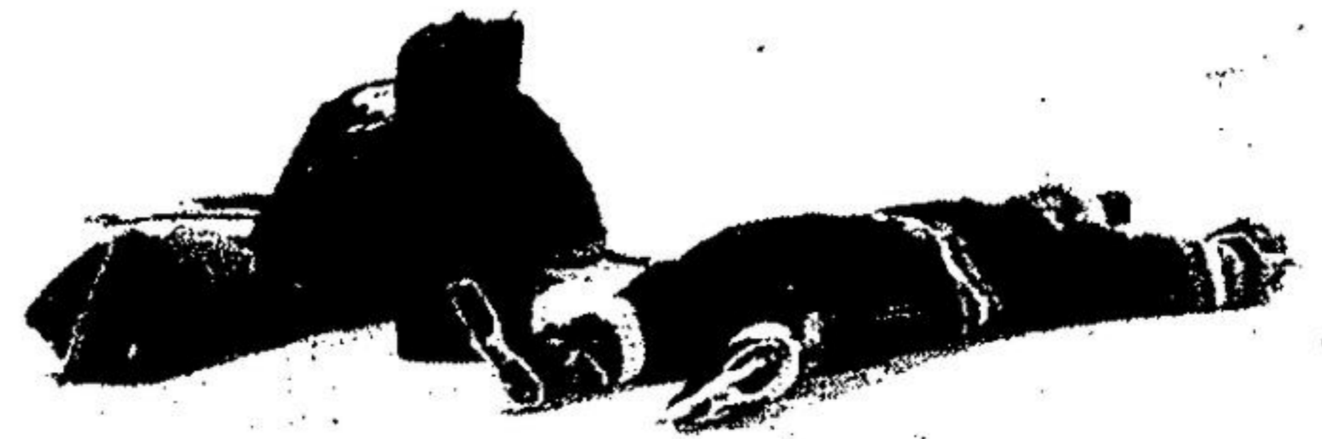
...yet so far

ANHL fans couldn't have asked for a more exciting final as the overtime game even featured a penalty shot in the third period. The Tiger shooter hit the crossbar on the attempt (above) and the two clubs eventually headed into OT.