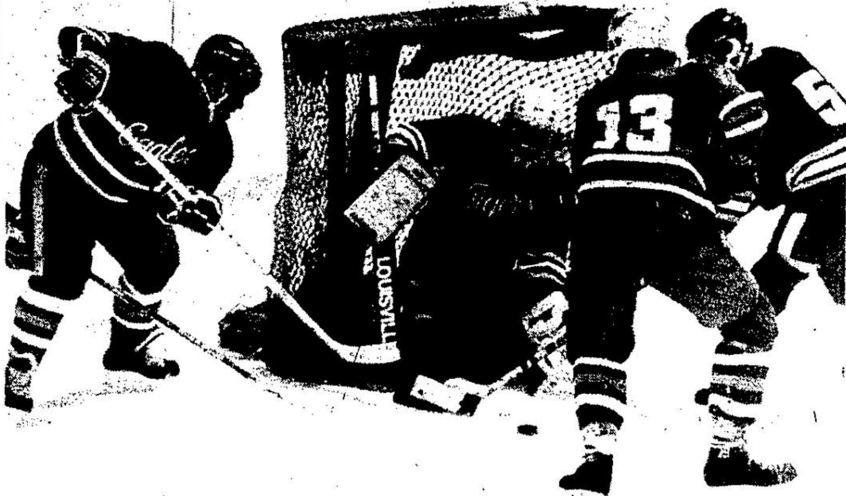
Hold that, Tiger

Eagles flocked around the Tigers net in last Saturday's Acton Non-contact Hockey League championship game at Acton Arena. Fans were treated to a thrilling final as the Eagles came back from a 5-3