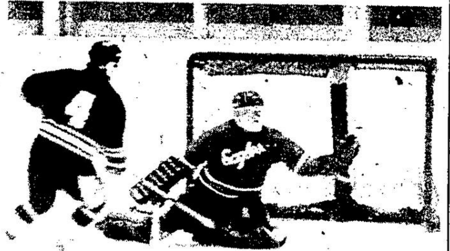
So close, but...

deficit to score a 6-5 overtime sudden death overtime win. Tigers, however, managed to bar the door on this play.