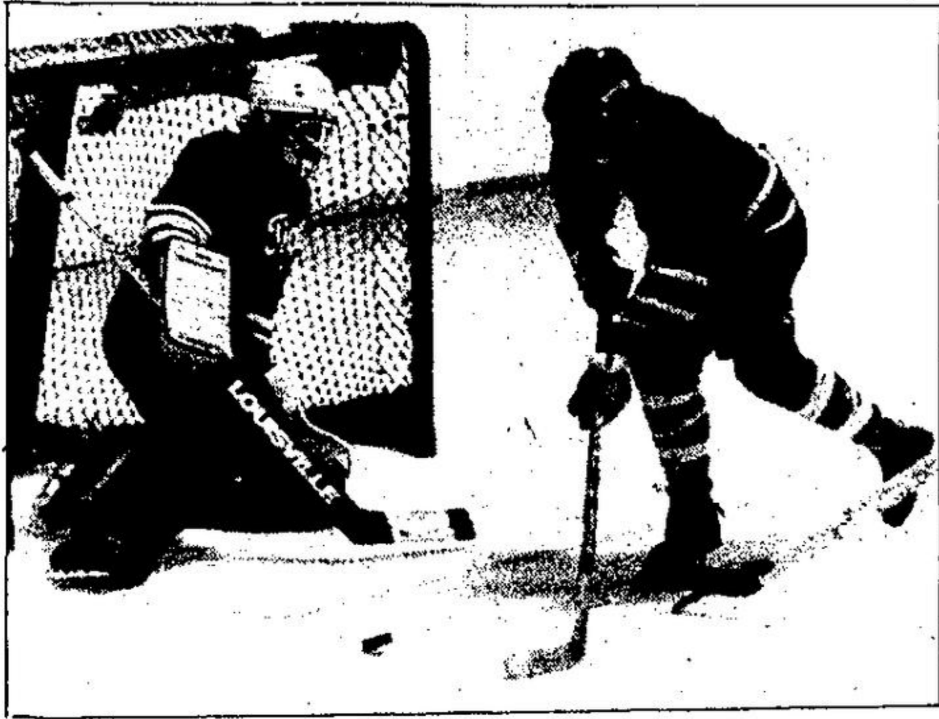
One on one

Acton Tigers goaltender makes the stop on this shot by an Eagle forward during Saturday's Acton Non-contact Hockey League final at Acton Arena. Eagles overcame a two-goal third period deficit to win the league title with an exciting 6-5 overtime triumph. More on page 26.