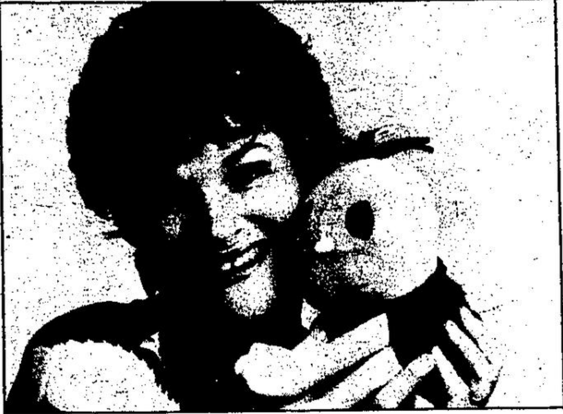
Charlotte Diamond plays in February next year.

Advance tickets for this series will be available at the Halton Hills Cultural Centre on Sunday, April 2, between 1 p.m. and 5 p.m. Advance series ticket price is $12.50. The September price will be $14. For further information call 877-1575.