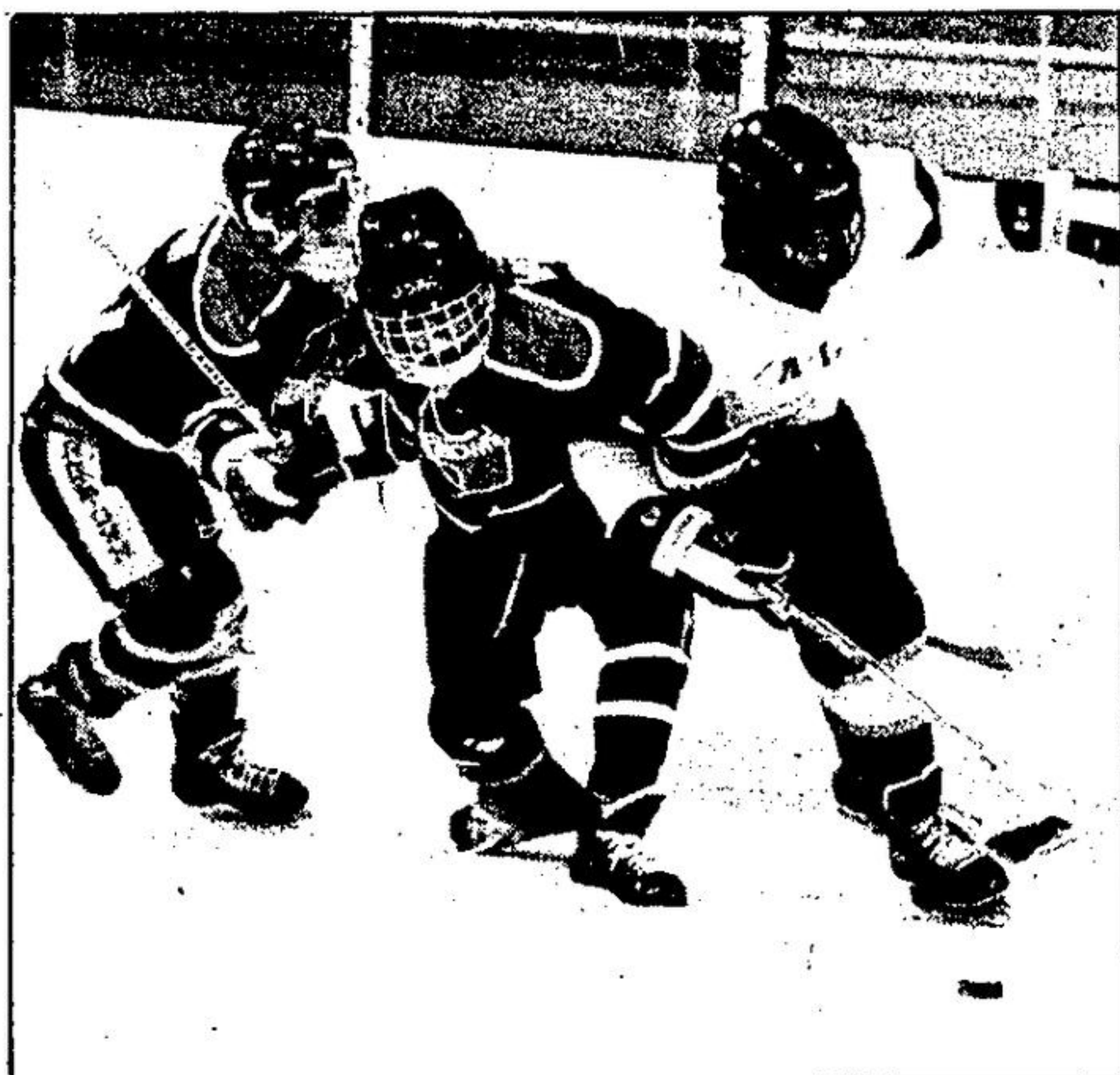
Arm in arm

A member of the Georgetown Bantam Minors employs an arm bar as he wrestles a Paris defender for the puck during GMHA Bantam Tournament action last week at Alcott Arena. The Minors had a tough time, losing all three of their games, but worked hard as one of two Georgetown squads in the annual event.