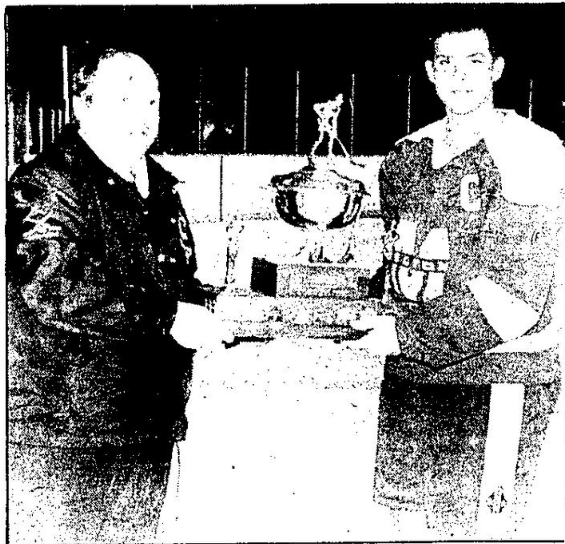
Holding the hardware

A member of the Georgetown Bantam Minors employs an arm bar as he wrestles a Paris defender for the puck during GMHA Bantam Tournament action last week at Alcott Arena. The Minors had a tough time, losing all three of their games, but worked hard as one of two Georgetown squads in the annual event.