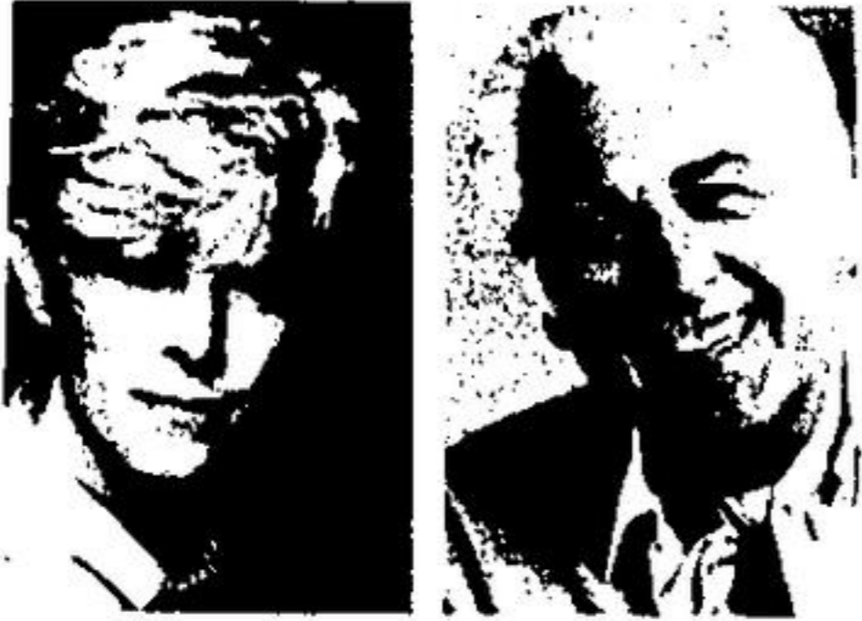
David Bowie Stewart Granger

A. Candace Cameron is her name, and she is 12.