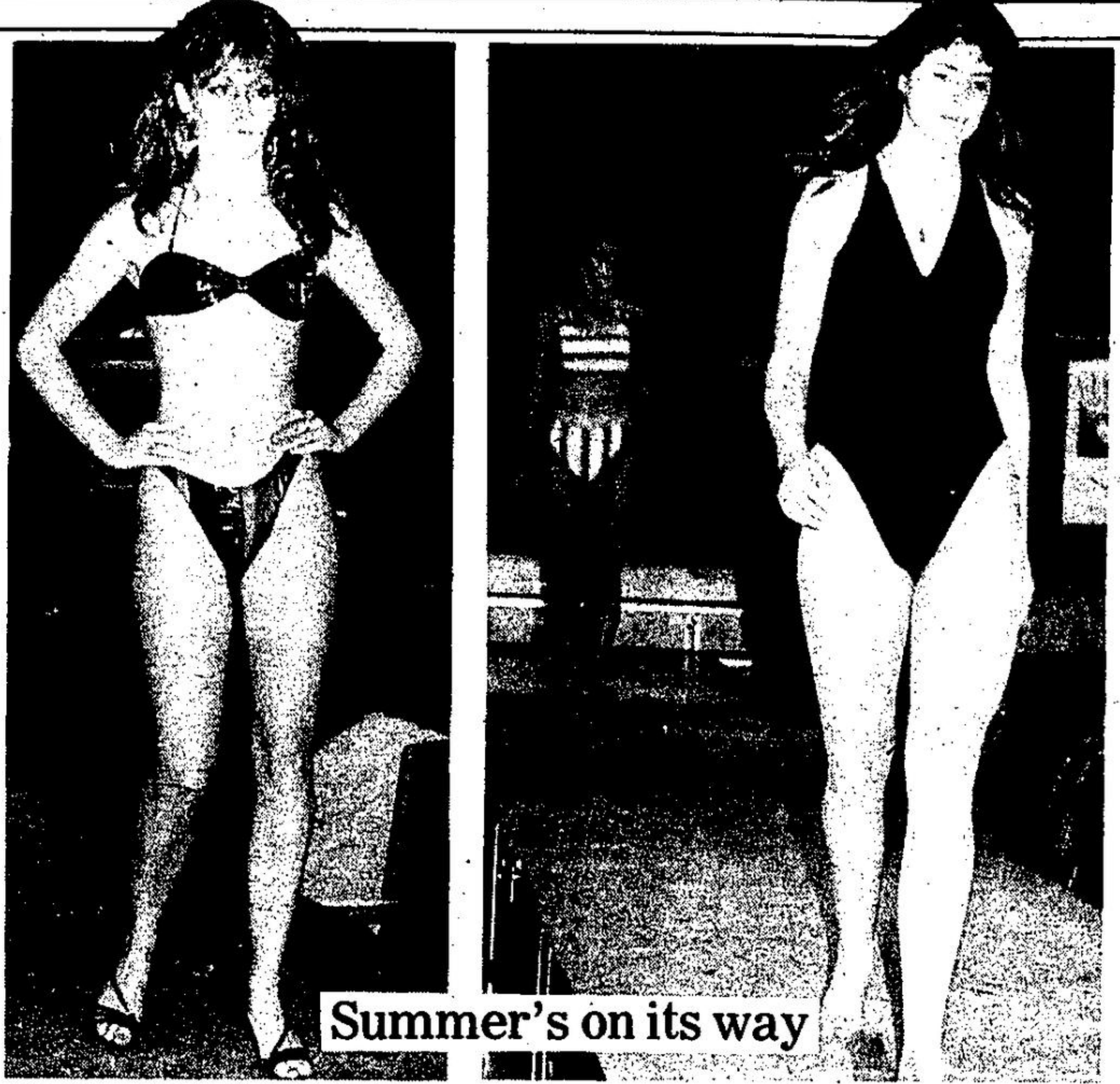
Summer's on its way

Georgetown District High School students are raising money to organize a trip to Germany and Austria for the band and the jazz choir in April for 10 days. Each student must raise about $1,400 for the trip. Events like this fashion show by Elizabeth's Fashions are helping the students' fundraising efforts. Above, these two ladies show off some of the swimsuits now in style.