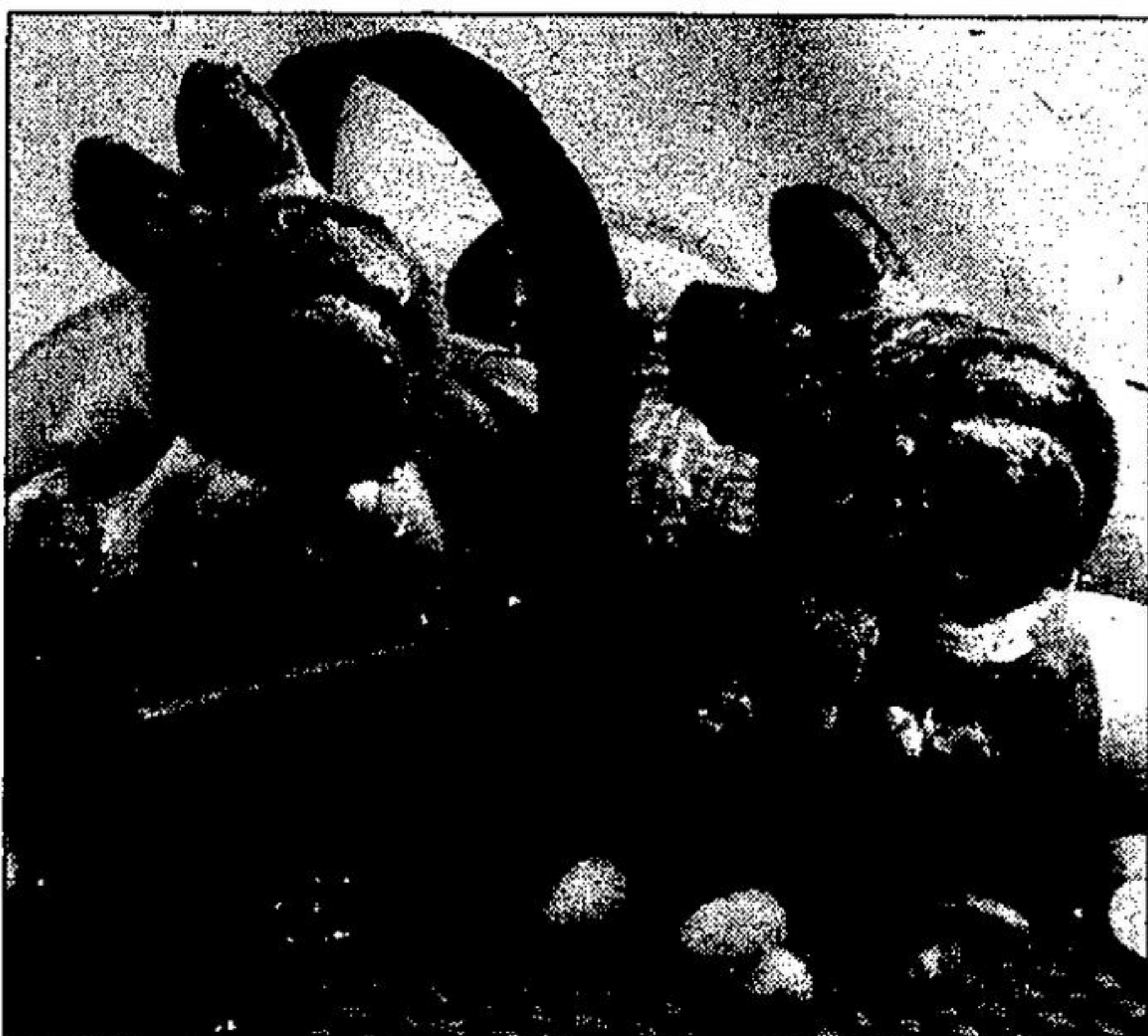
Bread bunnies go with any meal but they're especially nice served for breakfast with fresh preserves.

little, however, to the person hogging the remote control.