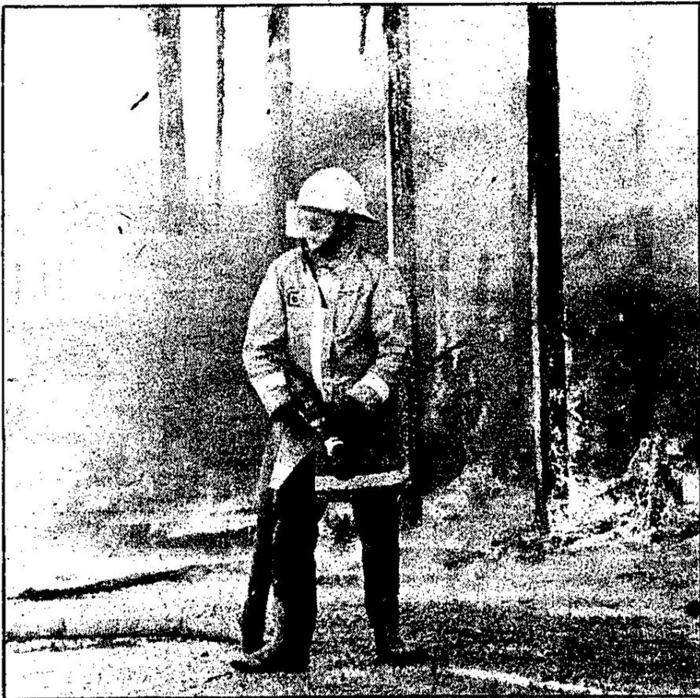
A firefighter prepares to spray water on the remnants of a burning building at CCP Liquidators north of Georgetown. Water had to be trucked to the fire scene by tankers.