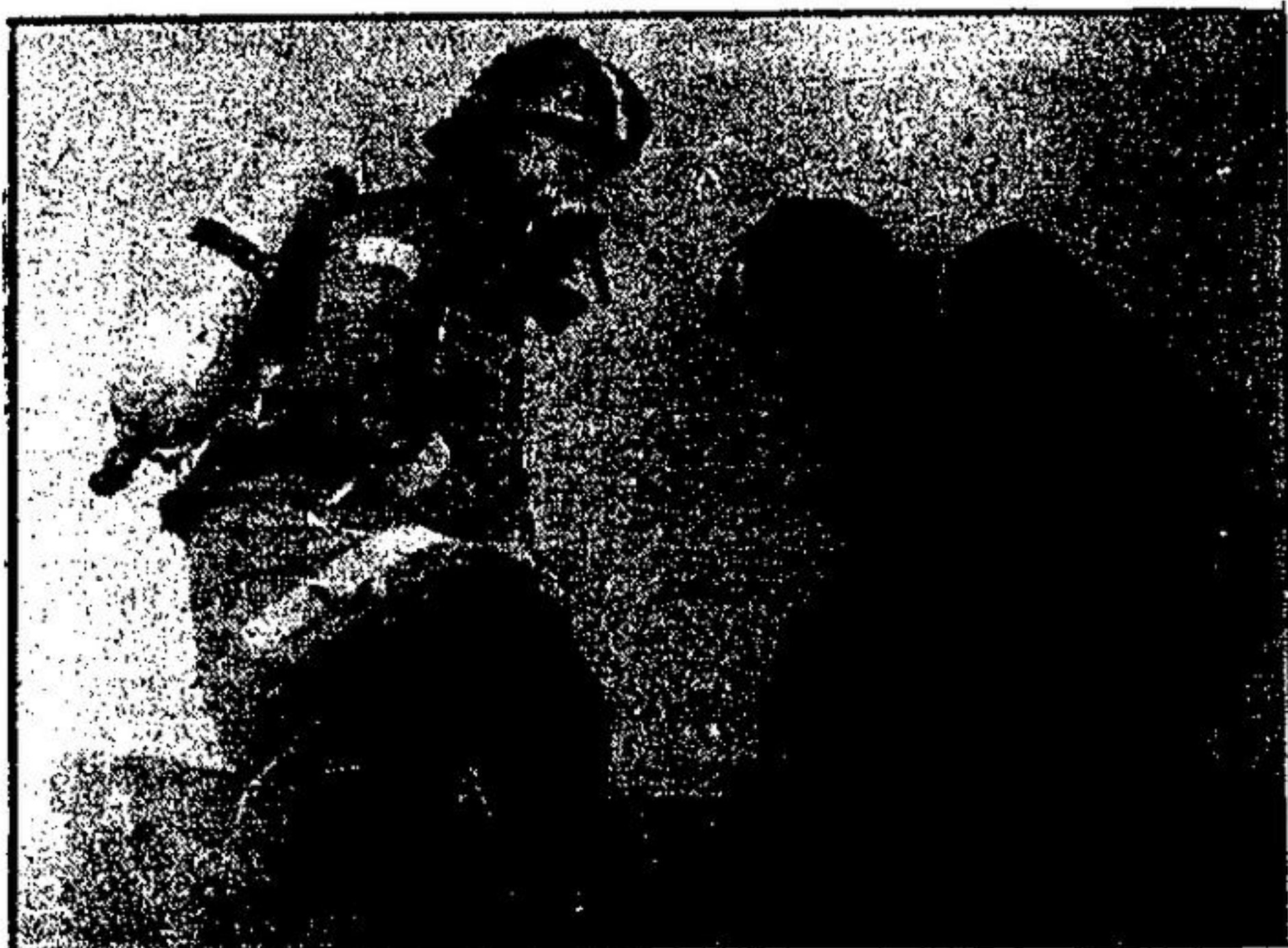
Wearing oxygen masks to avoid smoke inhalation, firefighters worked from the roof of the burning building to prevent the fire from spreading to a nearby furniture store.