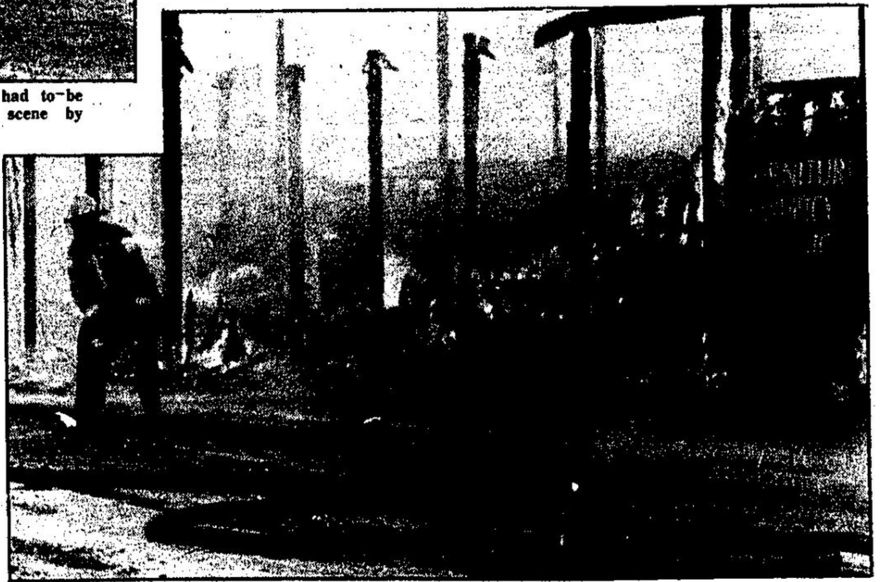
The building that housed CCP Liquidators, Atlantis Sleep Systems and Country Video was quickly razed Wednesday after a fire broke out in the video store. The cause of the fire is as yet unknown.