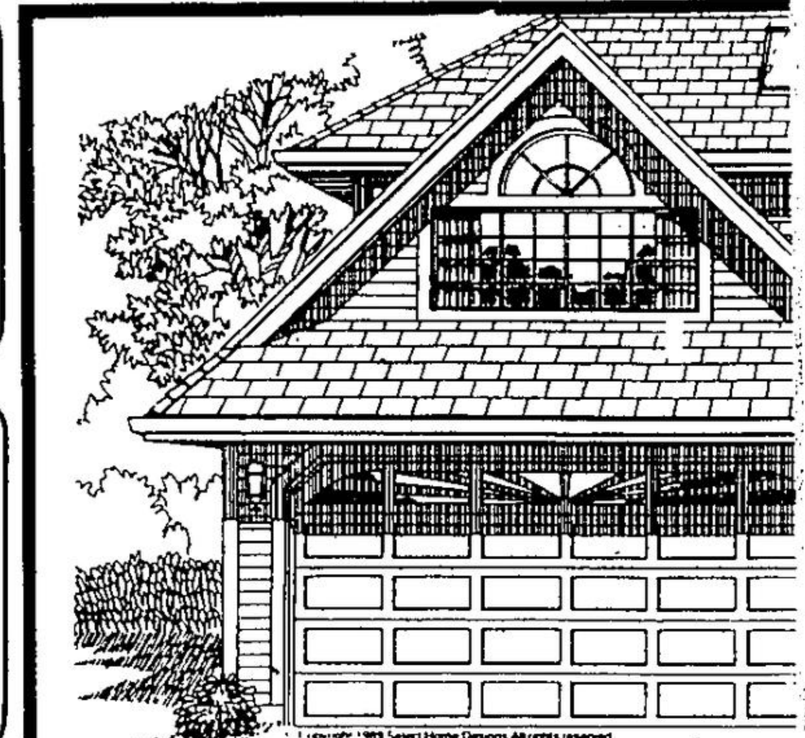
PLAN NO 1689-2209