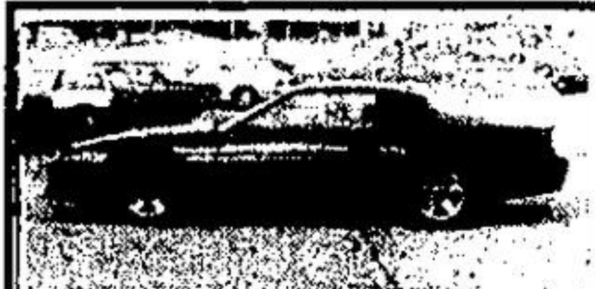
87 CAMARO IROC Auto., 5.7 Lt., Black With Red Leather Interior