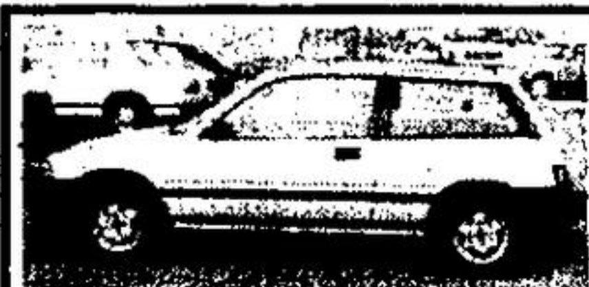
84 HONDA CIVIC 2 Door Hatchback 4 Sp., ST/CAS, S/R