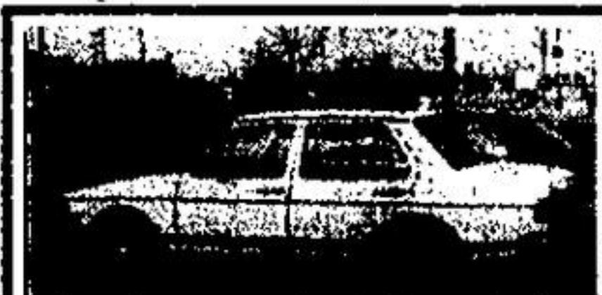
82 JETTA DIESEL 5 Speed, Sunroof, Air Con.