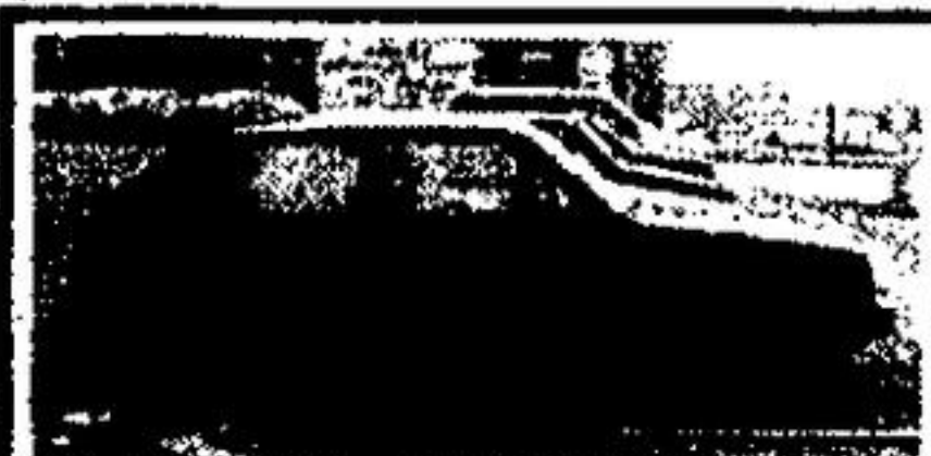
85 VW GOLF 2 Dr., 5 Speed, Navy Blue, Complementary Cloth Interior