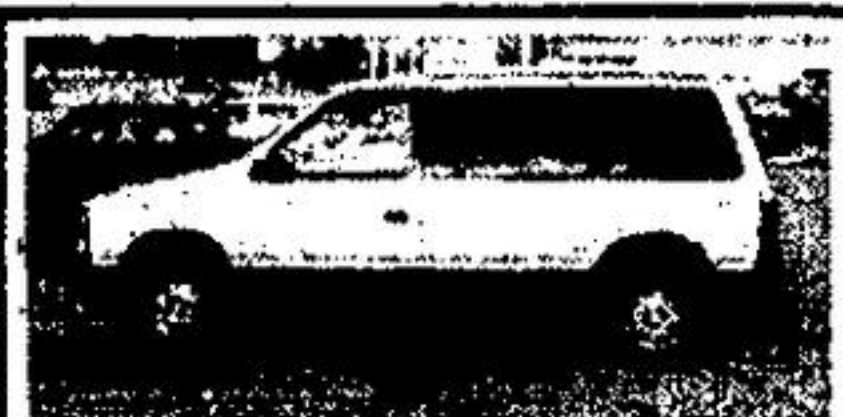
86 DODGE CARAVAN LE P/W, Air, Auto, SS/CAS