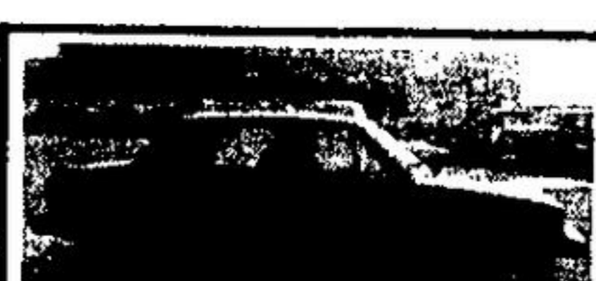
84 JETTA GL Turbo Diesel, Sunroof ST/CAS, 5 Speed