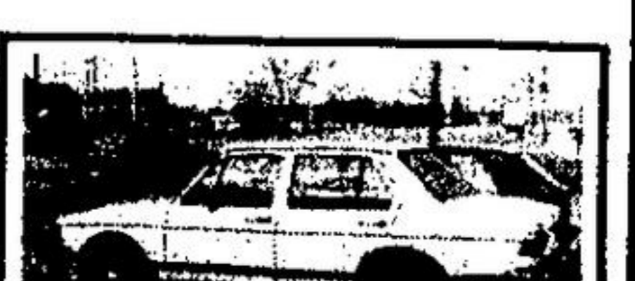
82 JETTA DIESEL 5 Speed, Sunroof, Air Con.