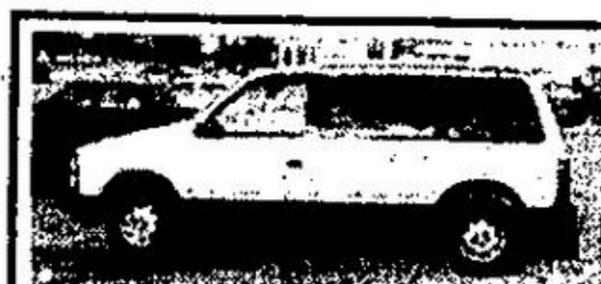
86 DODGE CARAVAN LE P/W, Air, Auto, SS/CAS