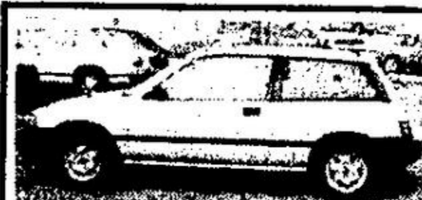
84 HONDA CIVIC 2 Door Hatchback 4 Sp., ST/CAS, S/R