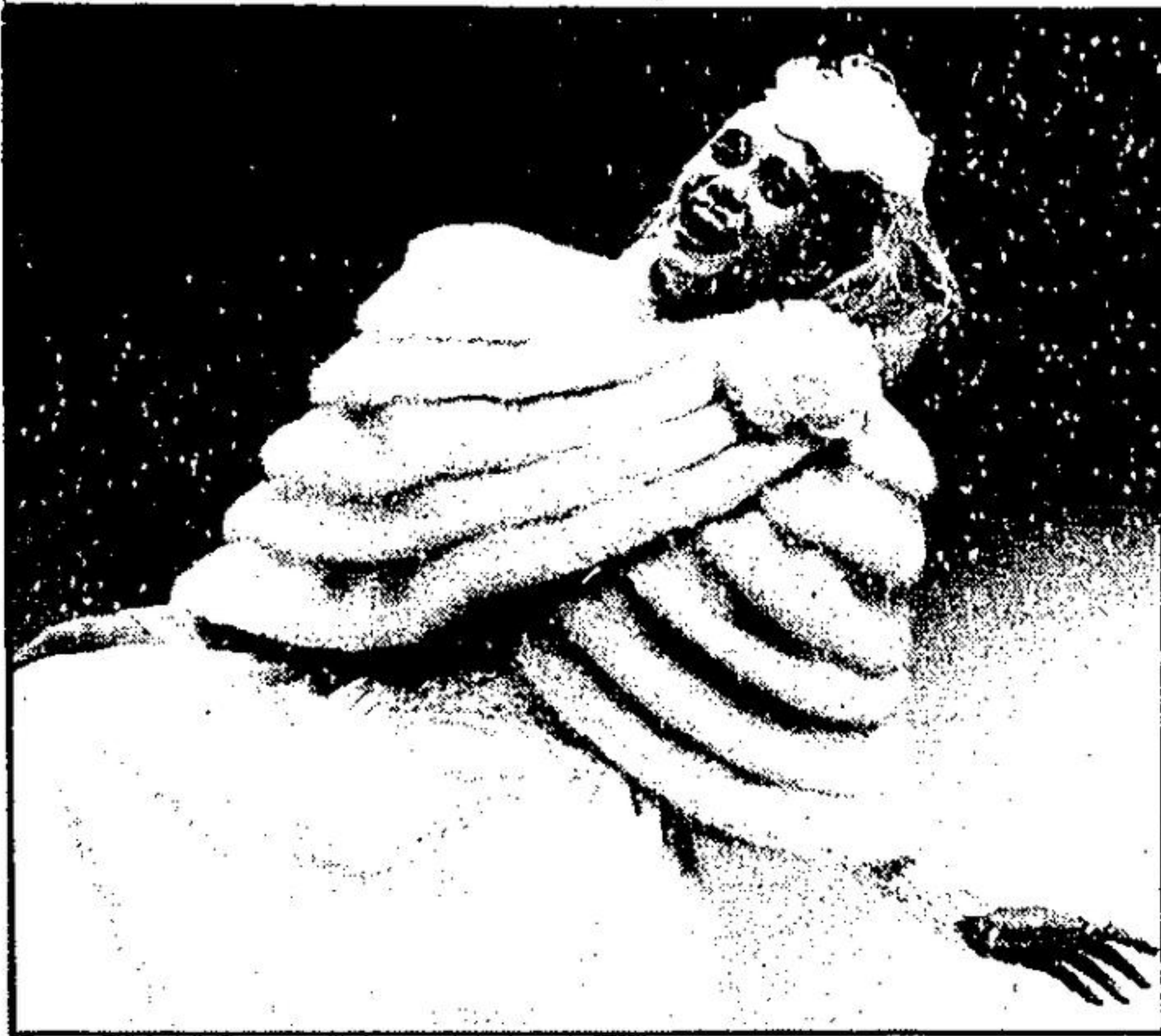
WALK DOWN THE AISLE ROYALLY IN FUR. Winter brides will look exceptionally elegant and keep warm, too, wrapped in a multi-tiered white tulle cape designed by Louis Milona and Sons, Inc. After the wedding, you can wear your fur over black, white, brights and pastels for many anniversaries to come.