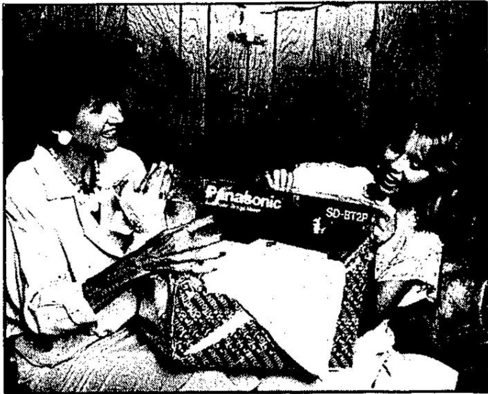
A PERFECT GIFT for any young bride is the Panasonic automatic "Bread Bakery." Simply add the ingredients, set the digital timer before leaving for work, and the unit's microprocessor computer automatically kneads, mixes and bakes. Within four hours, a delicious loaf of fresh bread will be waiting for dinner. With less time spent in the kitchen, there's more time for yourself. BR893648