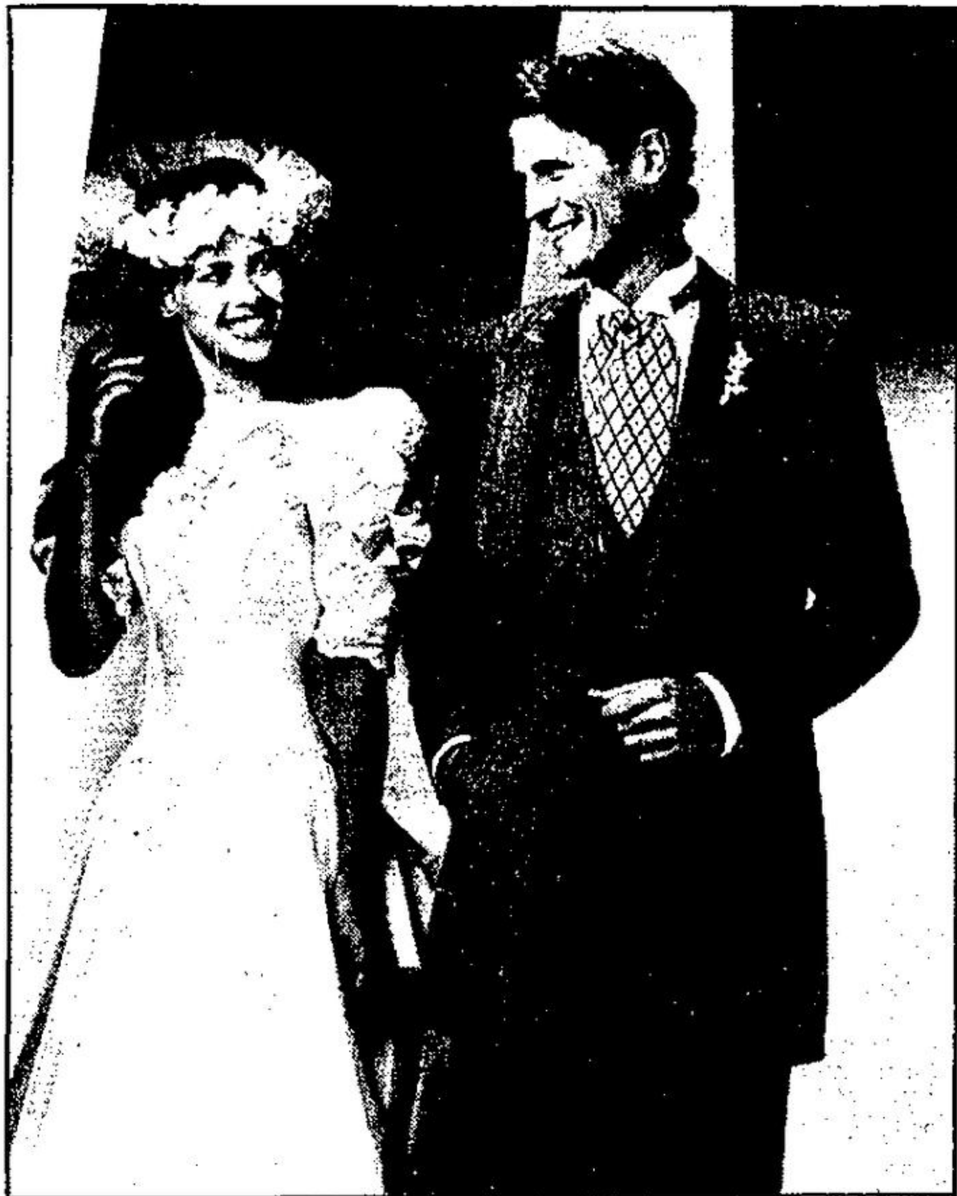
GRAND, GLORIOUS AND TRADITIONAL: It's those very special looks shared by the bride and her groom that make a wedding so memorable. Her gown by Michele Piccione for Alfred Angelo is pure sentiment in taffeta with appliques of hand-headed lace. His proud stance is heightened by the streamlined cutaway designed by Pierre Cardin. Textured fabric in the coat and double breasted vest makes a dramatic fashion statement with distinctive striped trousers. Diamond pattern ascot and wing collar are the accessories specified by Pierre Cardin. BR893.177