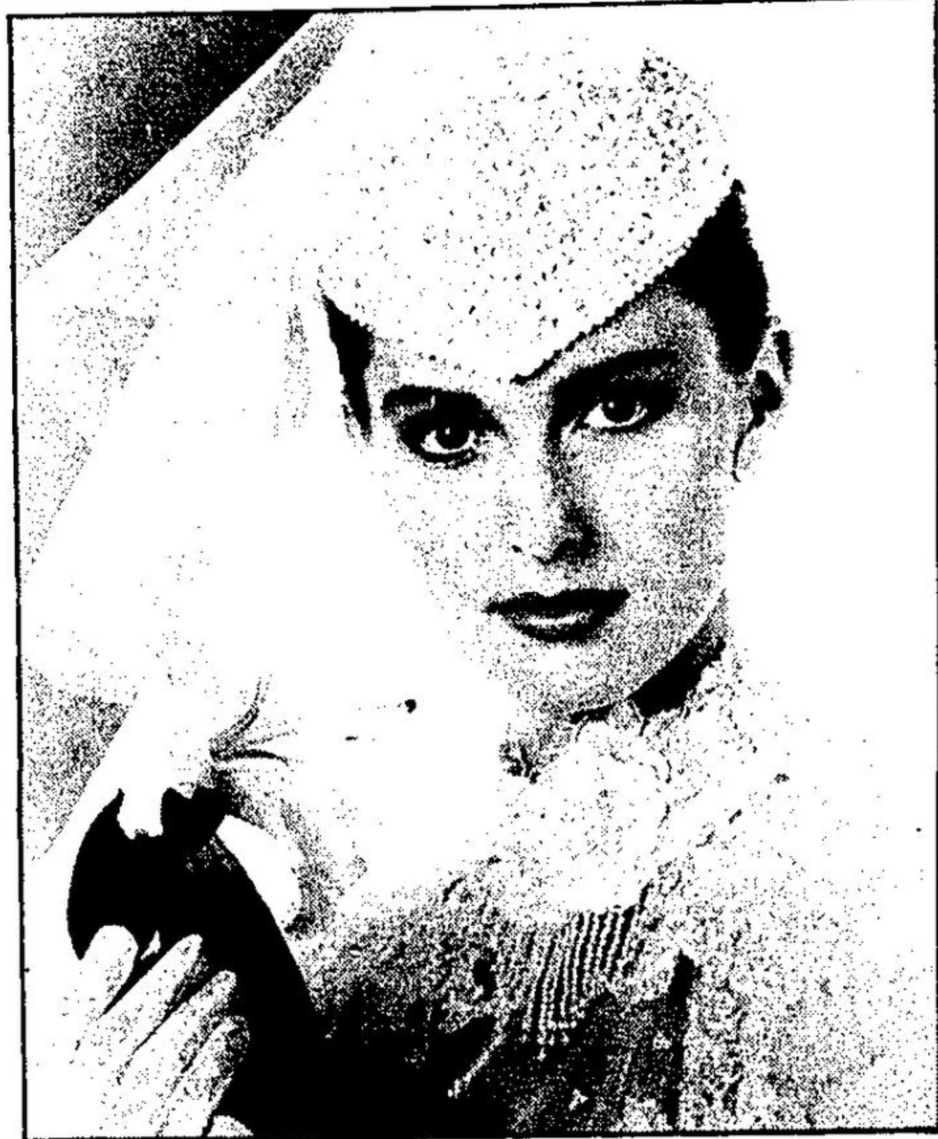
THE BRIDE should wear pretty color and plenty of mascara so that her eyes stand out behind her veil.

"If you've done as much planning ahead and dress rehearsal as possible, wedding day preparation should be relatively fail-safe, and you will be a beautiful, confident bride," Glenn says.