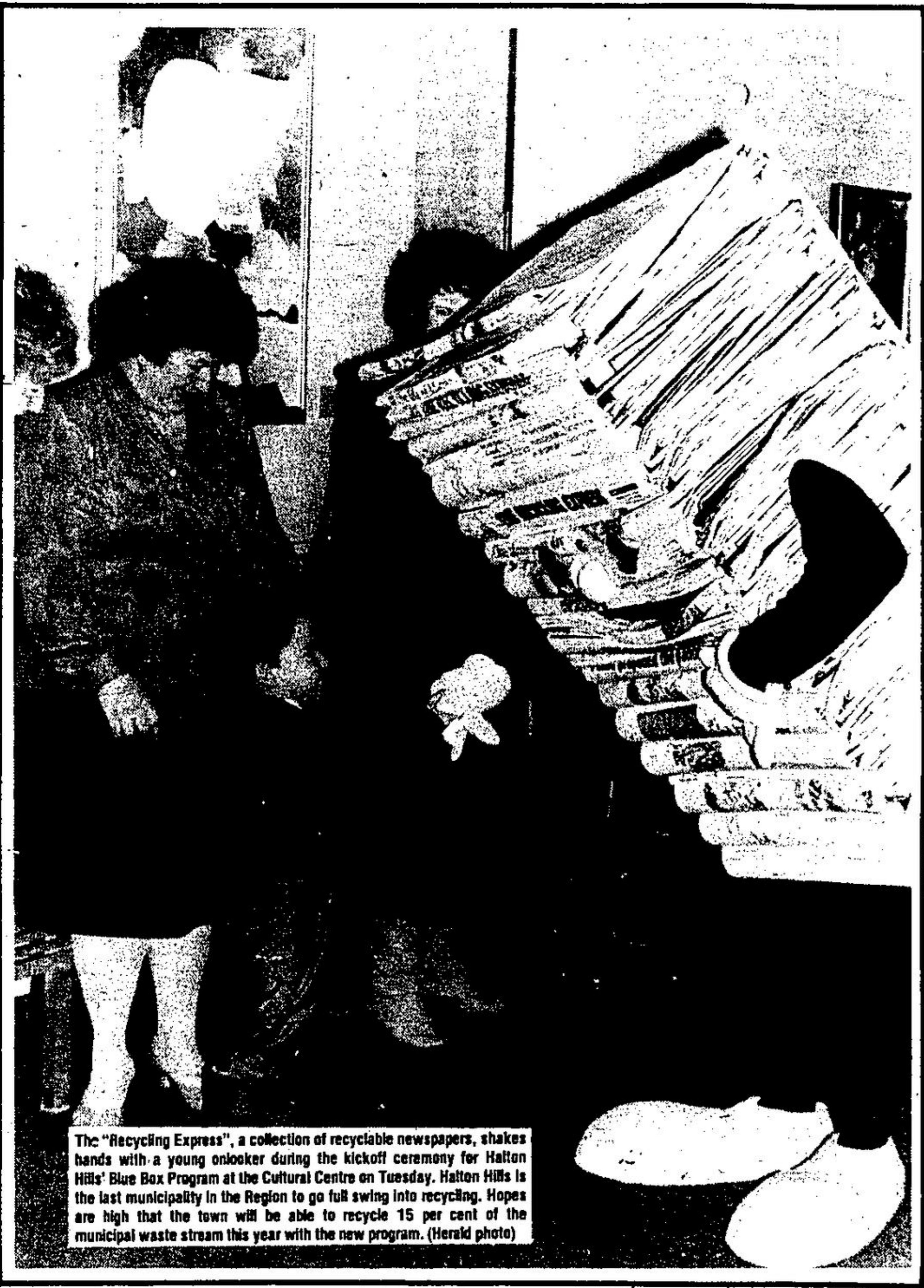
The "Recycling Express", a collection of recyclable newspapers, shakes hands with a young onlooker during the kickoff ceremony for Halton Hills' Blue Box Program at the Cultural Centre on Tuesday. Halton Hills is the last municipality in the Region to go full swing into recycling. Hopes are high that the town will be able to recycle 15 per cent of the municipal waste stream this year with the new program.