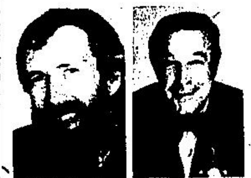
Jim Henson Gene Kelly