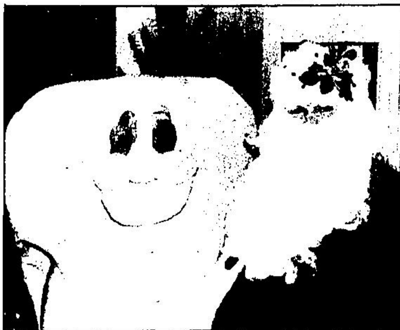
Santa Claus was a special visitor to the annual Rec Department Water Show at the Georgetown Indoor Pool last Saturday night. After the show, which featured life-saving demonstrations, synchronized