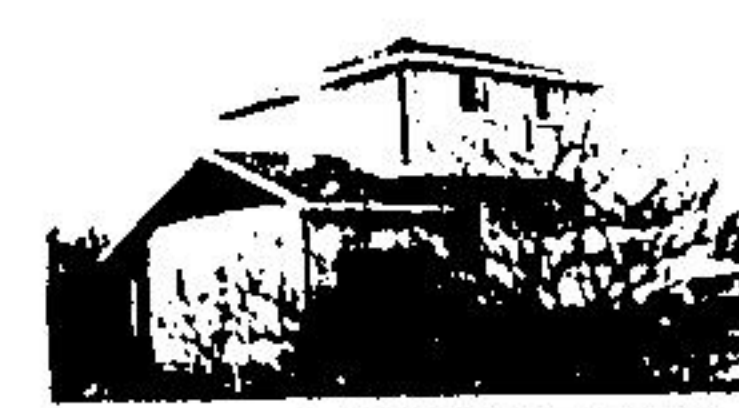
COMBO TOWN 'N COUNTRY LOT BRAND NEW — $169,900 3 plus bedrooms, 2 walkouts. Call today for information on this. 8306