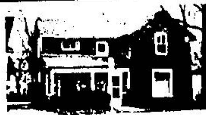
ACTON 3 PLEX — $169,900 2 - 1 bedroom and 1 - 2 bedroom apartments. 3 car garage 8311