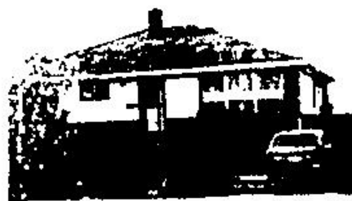
$147,900 — Acton Terraced lot with park view. Florida room off rec room. See it today! 8308