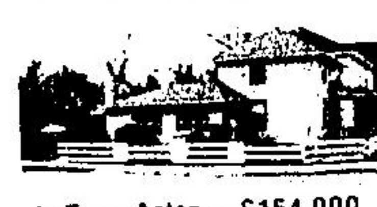
In-Town Acton — $154,900 WITH COUNTRY LOT AND STREAM 3 bedroom, main floor family room. Call now to view. 8307