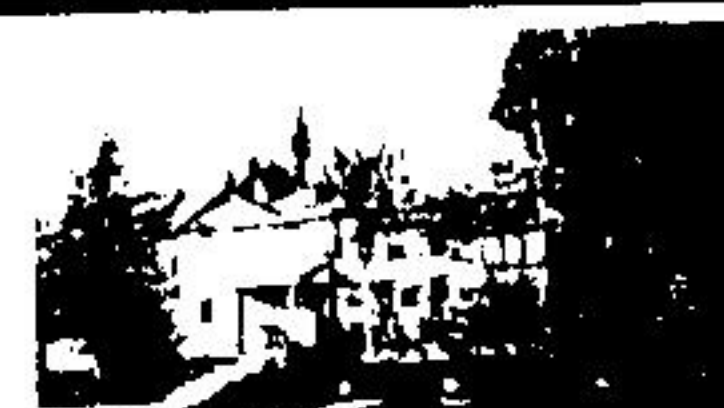
Rockwood 3 Plex $189,000 Main Street location 8313