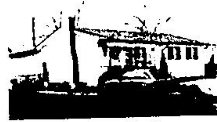
Georgetown — $210,000 Spacious in-law suite. 223 ft. lot. Call for details. 8308