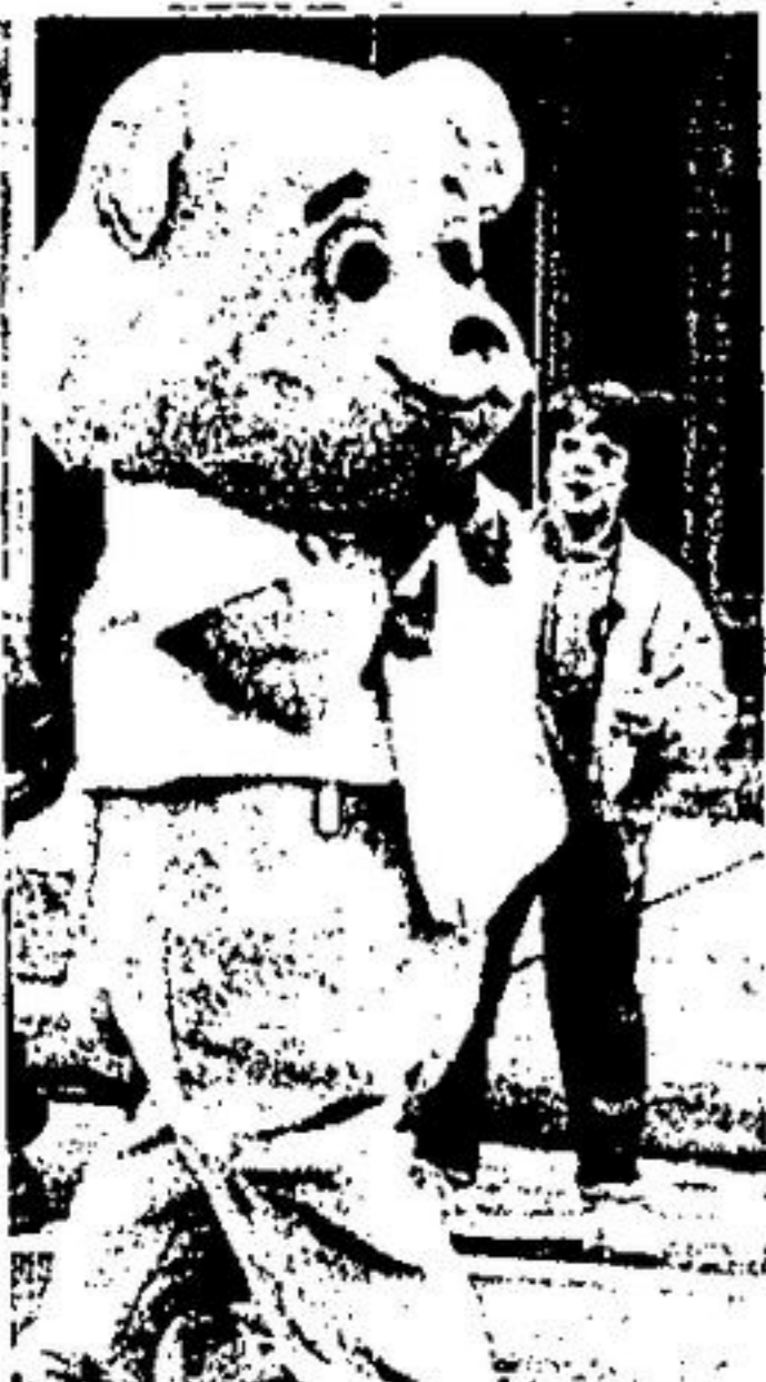
The weather for Saturday's parade was certainly bear-able.