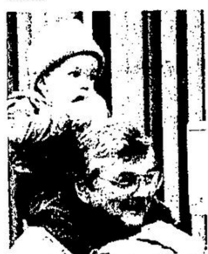
Having a little help when you're trying to catch a glimpse of Santa is always nice.