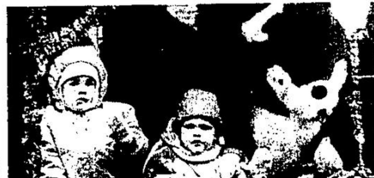
The imagination and effort that went into the many floats of Saturday's parade was rewarded with the approving applause of the hundreds who lined the parade route. And these youngsters were a big hit with the crowd.