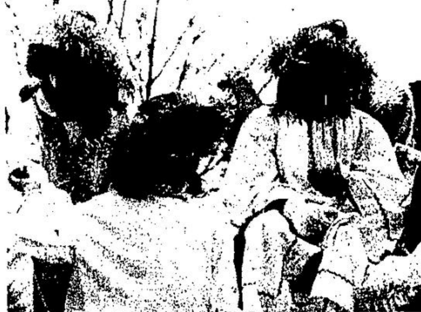
These "angels on high" were interesting floats in the parade. Passengers aboard one of the many floats.