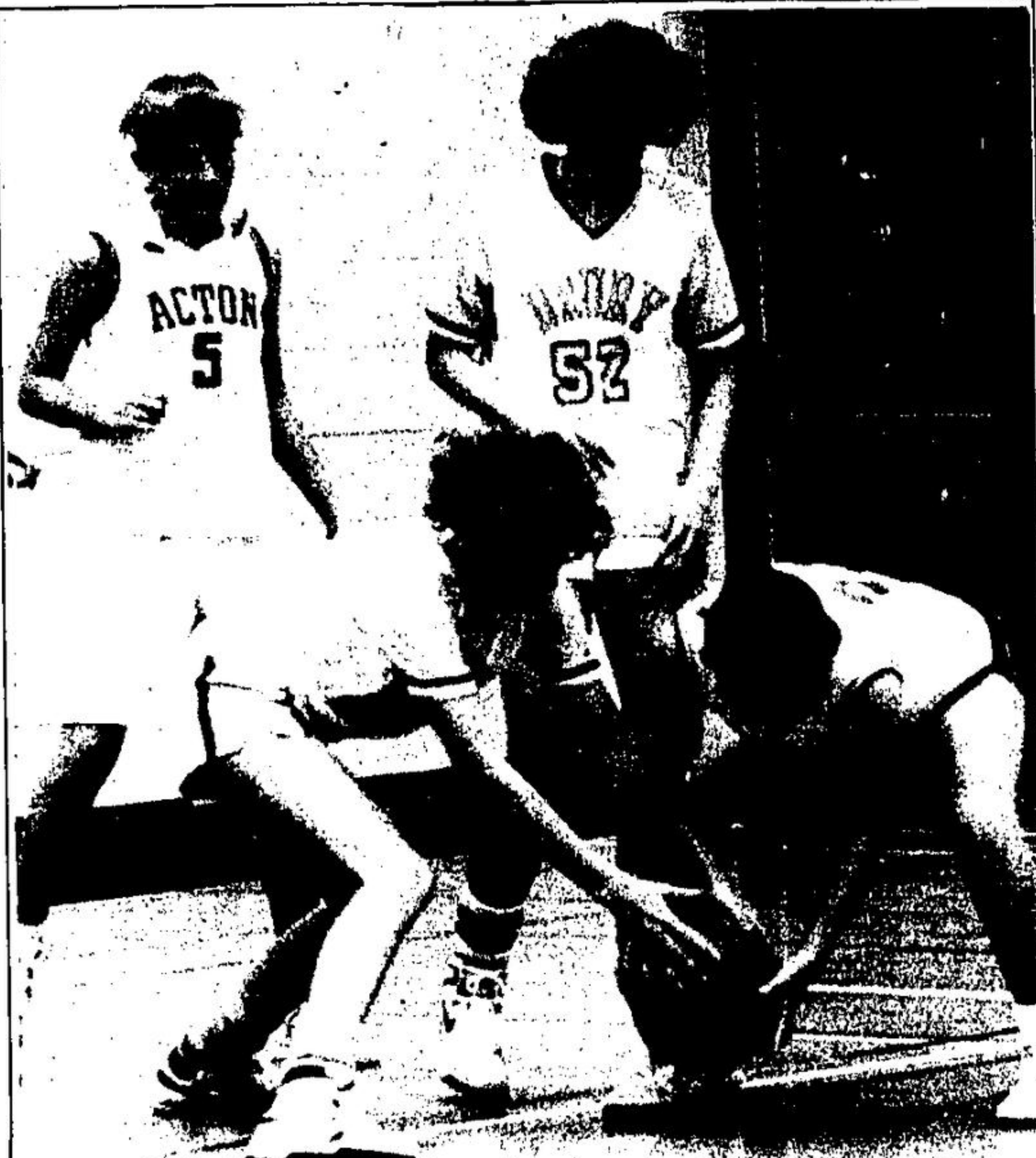
"Hey, it's mine!"

On Sunday night Georgetown Major Novices hosted Brampton. The game was extremely physical and looked more like the Philadelphia Flyers against the Boston Bruins than a non-contact game between nine-year-olds. Some body contact is inevitable but the opposition made