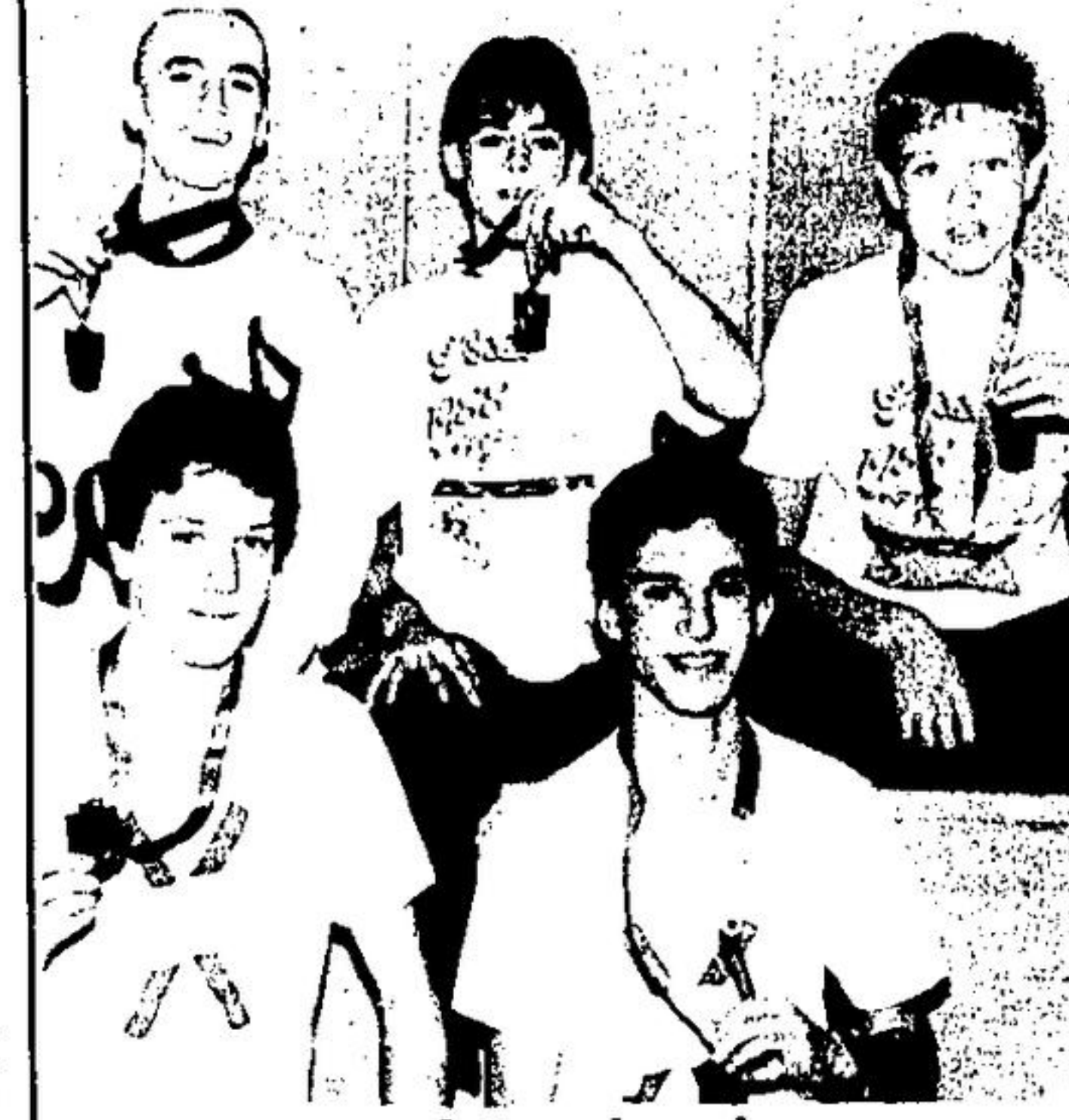
A happy bunch

The juniors lost their only regular season contest of the year last Wednesday at the conclusion of the schedule as Blakelock Tabbles earned an 8-1 win.