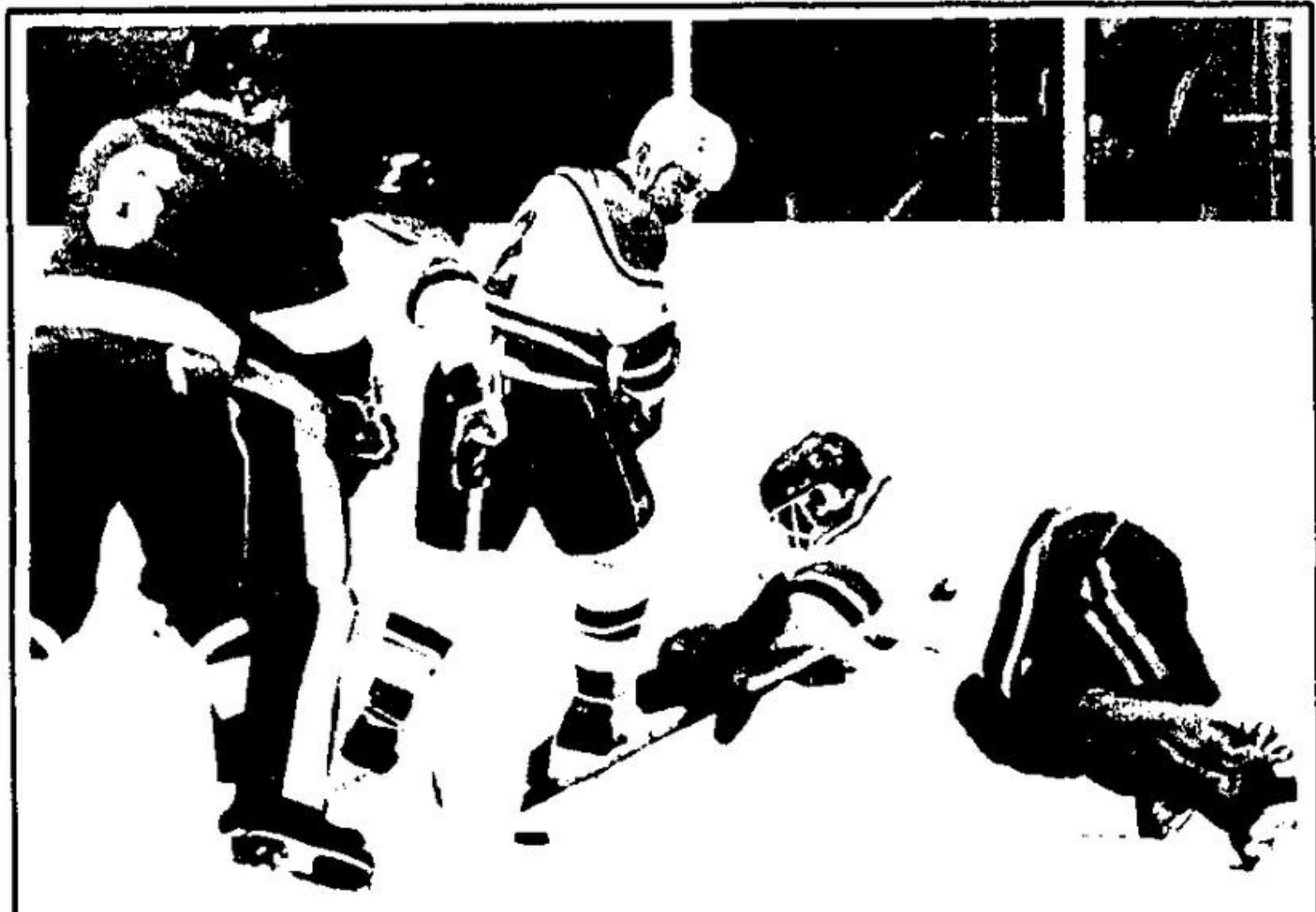
Getting a jump on it