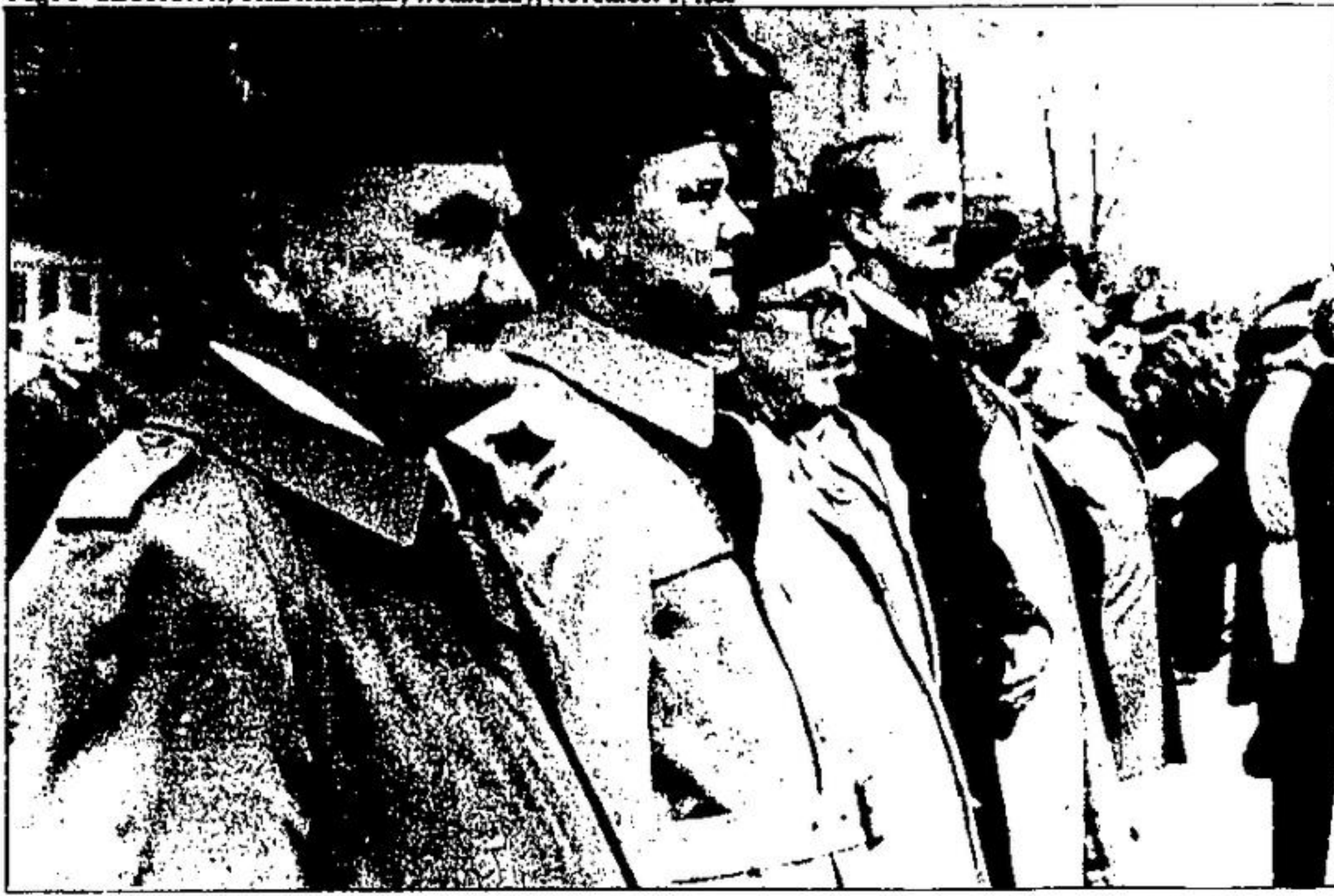
Remembrance Day ceremonies in Acton were solemn as veterans gazed on the cenotaph as the names of those who have fallen in action were read aloud, Sunday.