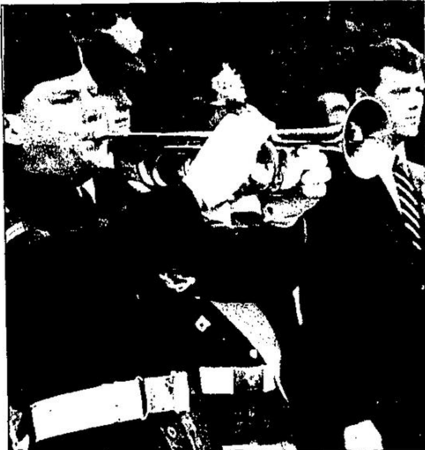
A member of the local Air Cadets blowing wind and snow, the park plays Reveille during the ceremonies at Remembrance Park in Georgetown Nov. 6. Despite a