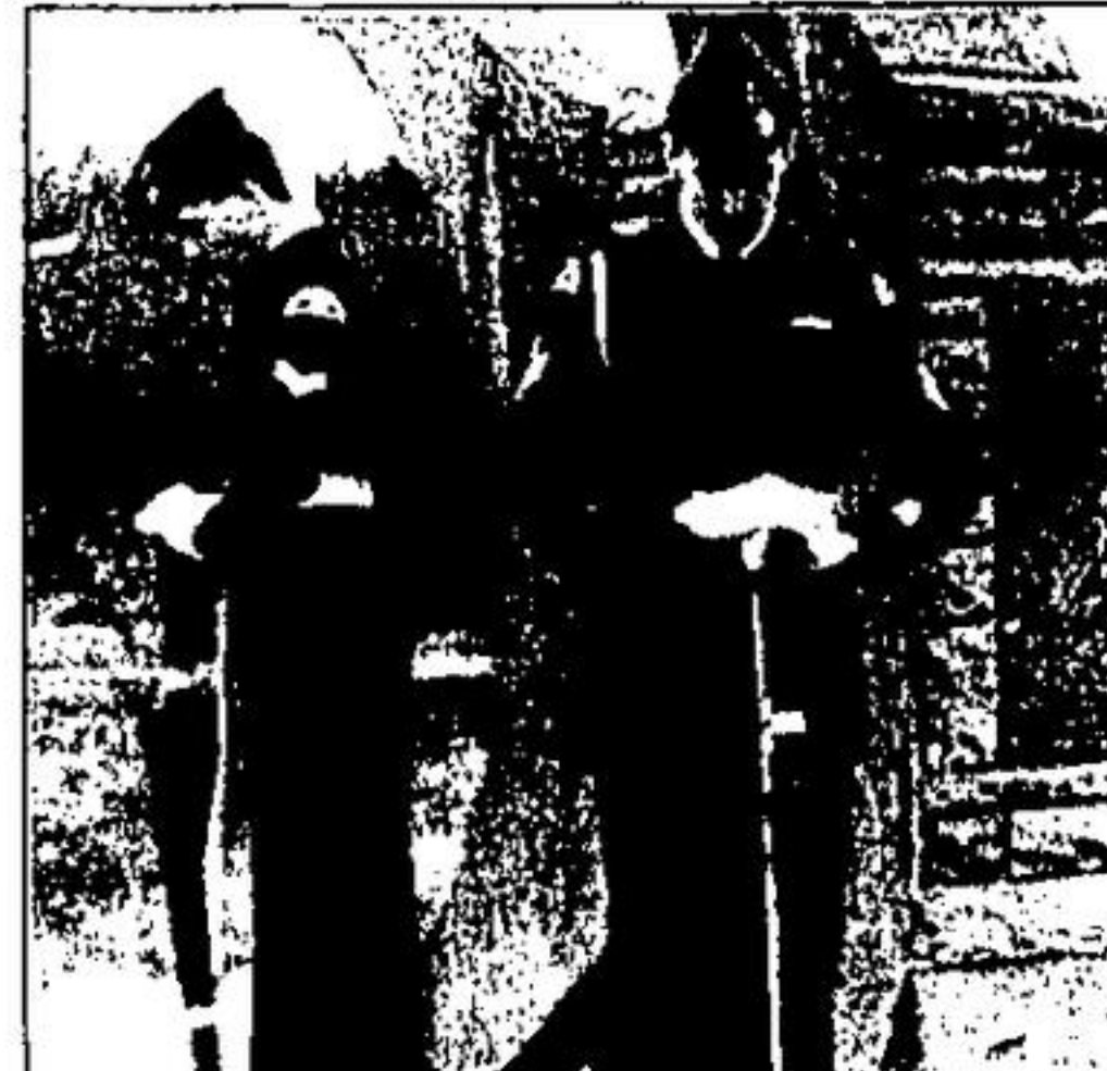
These young cadets stood guard at the Glen Williams Cenotaph during Remembrance Day ceremonies Sunday. The Glen Williams ceremonies were one of three held in Halton Hills that day.