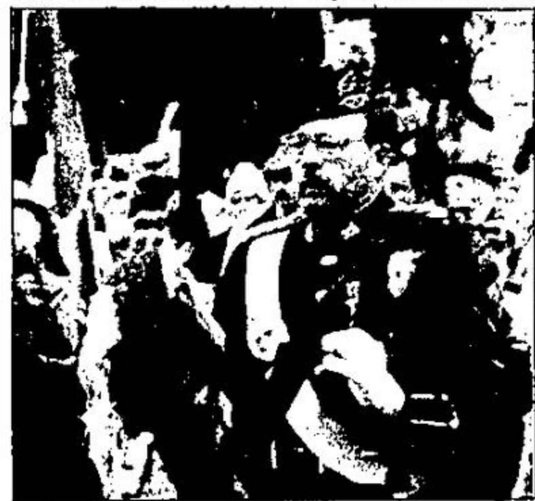
Members of C Company, Lorne Scots were among many community groups and organizations, to lay wreaths at the base of the cenotaph during Remembrance Day ceremonies in Acton Nov. 6.