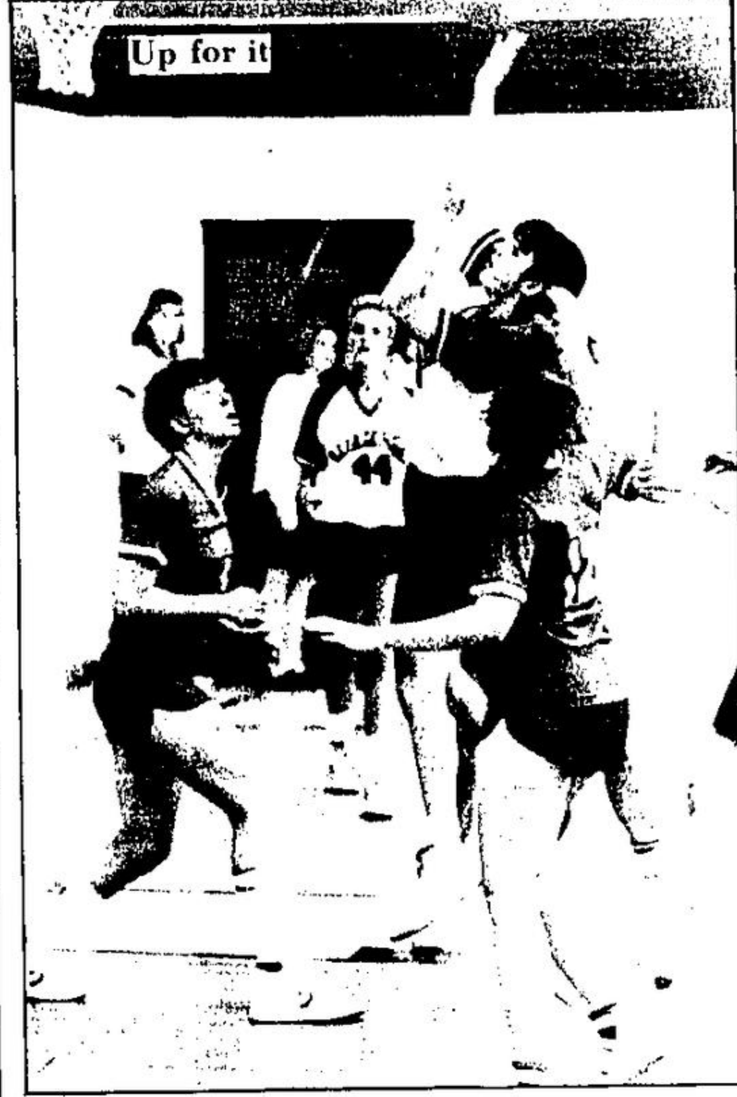
A Georgetown player goes for the hoop while Acton Redmen defend in senior girls basketball play at GDHS on Monday afternoon. Rebels downed Acton 41-27 to push their record to 6-1 while on the junior side Georgetown took a 37-24 victory.

It's not going to be just another hum-drum season in the NHL this year. And it's not just the Gretzky trade that will guarantee this fact. The NHL, which occasionally is exceeded only by the promotions department of the CFL for its ability to shoot itself in the foot, has really outdone itself this season. Sure, sure, Gretzky is in L.A. The Kings are instant contenders, the game may breathe new life in California and the Edmonton Oil Cans might have to work just a little bit harder to earn Lord Stanley's spittoon. But what about all the other exciting stuff about to take place in NHL rinks across the continent this year? Well, for one thing Guy Lafleur has dusted off the moth balls and will make a comeback at the ripe old age of 37. Wouldn't it be great if he scored 40 goals? Then maybe Phil Esposito might be persuaded to come out of retirement and centre for The Flower. Ex-players are getting a shot at the NHL coaching ranks. Guys like Terry O'Reilly, Jim Schoenfeld, Brian Sutter and Paul Holmgren. It's a refreshing change from the textbook, computerized, automation approach most popular in the league until Schoenfeld's Jersey Devils put the NHL in a tizzy.