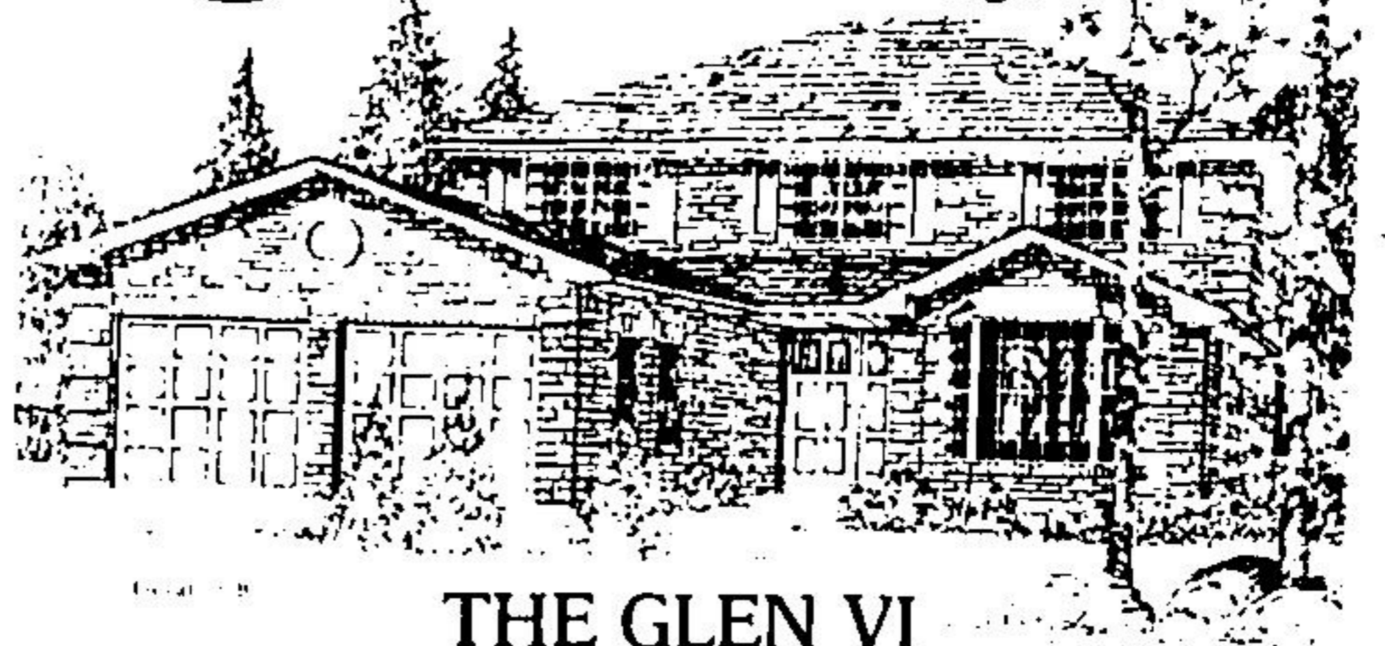
THE GLEN VI 2525 SQ. FT.