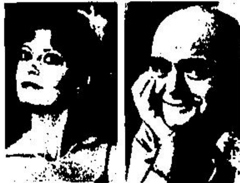
Susan Sarandon James Coco

A. You probably read (and soon after heard) that they might get married. They went together a long, long time, but eventually broke up. They never married.