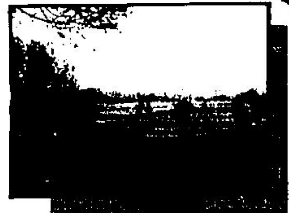
THE BACK YARD