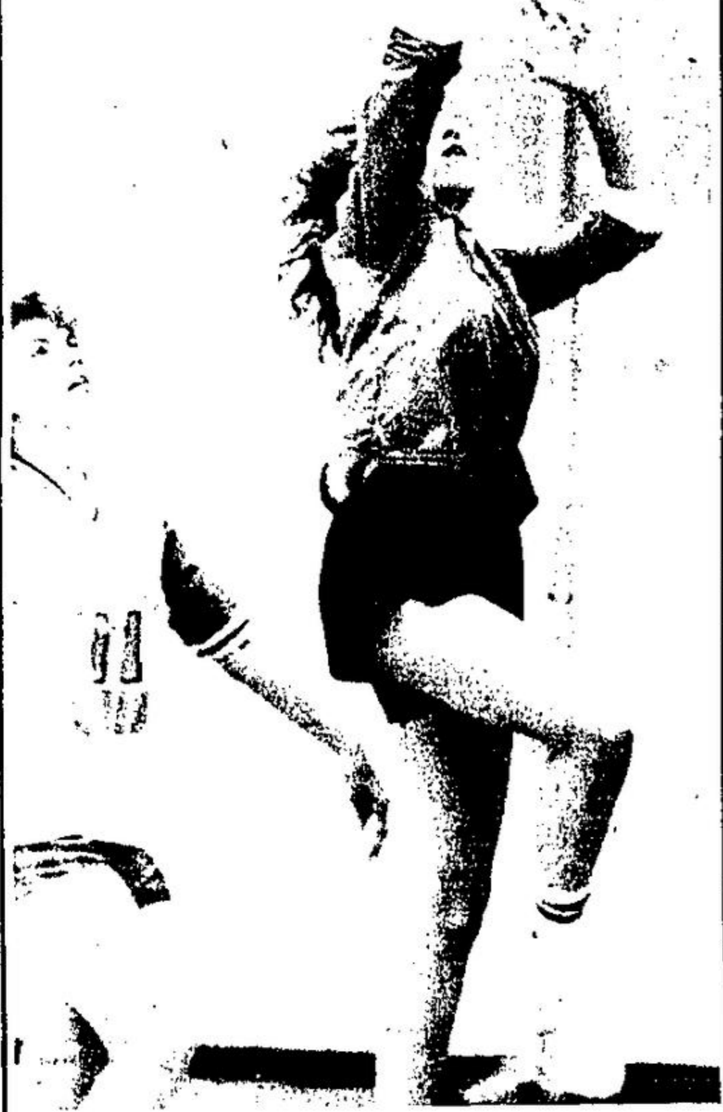
Up, up and away

"Connections '88 - Community Open House" is set for Saturday, Oct. 15, 10 a.m. - 4 p.m.