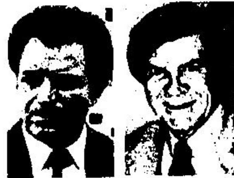
Vince Edwards Robert Preston