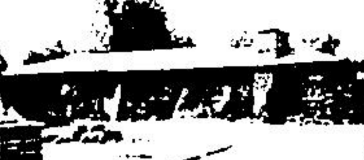
NEED MORE "LIVING" ROOM?