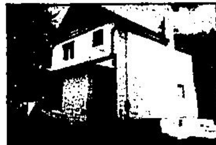
FABULOUS BIG LOT!

This Georgetown renovated home is a treat to see. Stone fireplace in the living room, separate dining room, lovely pine kitchen, and a main floor laundry room. Don't miss it for $179,900. Call Glenda Hughes, Sales Rep. for more charming details. NRS 8141