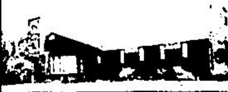
ALL THIS FOR $385,000!

If you enjoy the privacy and wildlife a ravine can offer then call me on this one. 3 bedroom split level with main floor family room and spectacular living area. Double car garage and a quiet court setting. John Hill, Sales Rep. 873-0300 or 877-8402. NRS 8117