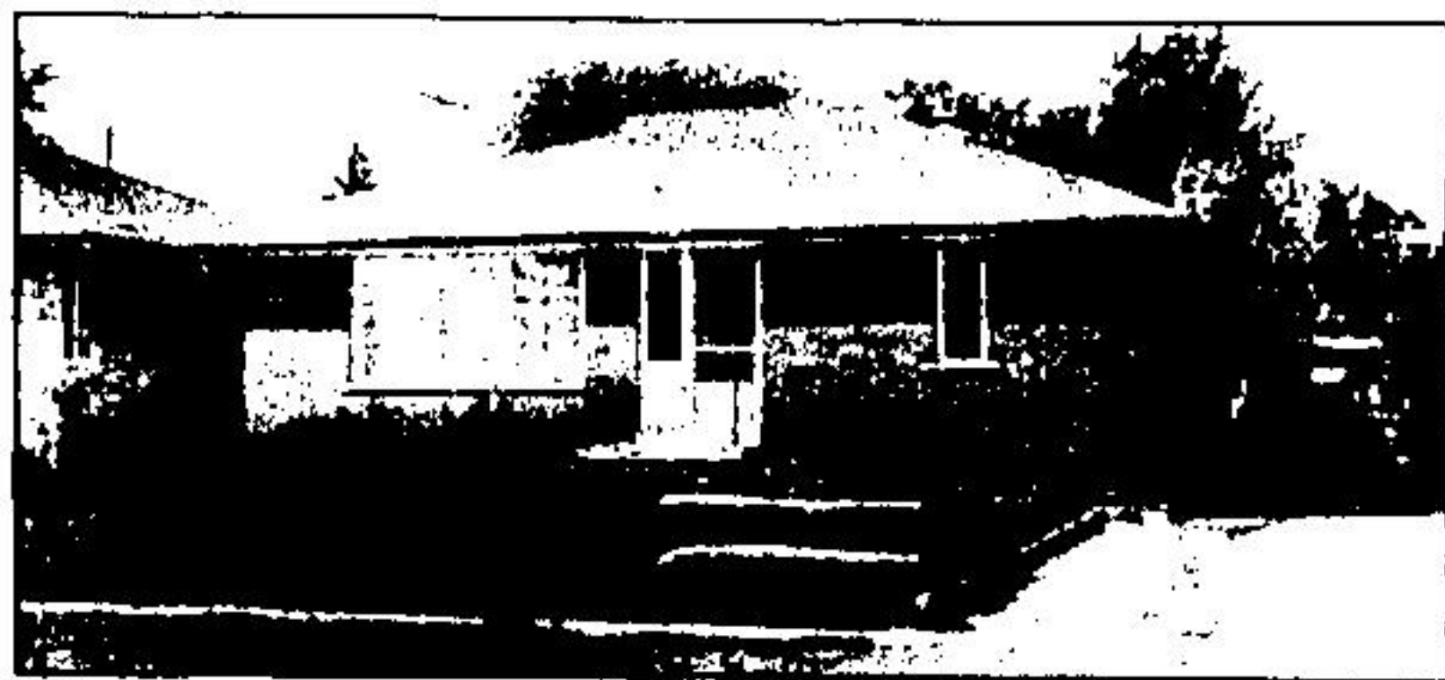
3 bedroom brick bungalow. Awaiting new owners! RM8226

FOR SALE — 10 acre building lot. Call Michael J. Adams — 877-5211