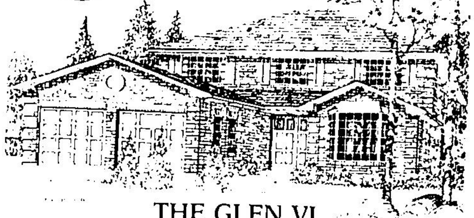
THE GLEN VI 2525 SQ. FT.