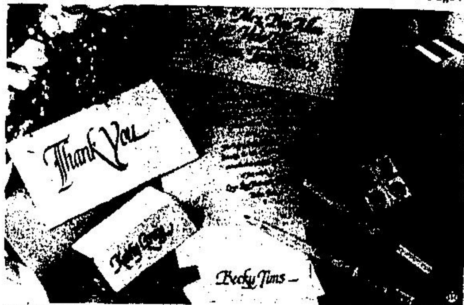
CALLIGRAPHY is a distinctive way to enhance wedding invitations and thank-you notes. SPEEDBALL® Elegant Writer™ calligraphy markers, available in a wide variety of popular colors and a selection of nib widths, are ideal for the novice calligrapher.

Love Potions: A Book of Charms and Omens (Salem House Publishers), written by Josephine Addison and illustrated by Diana Winkfield, relays to the reader a variety of ancient love potions, incantations and beliefs in a way that is at once whimsical and informative.