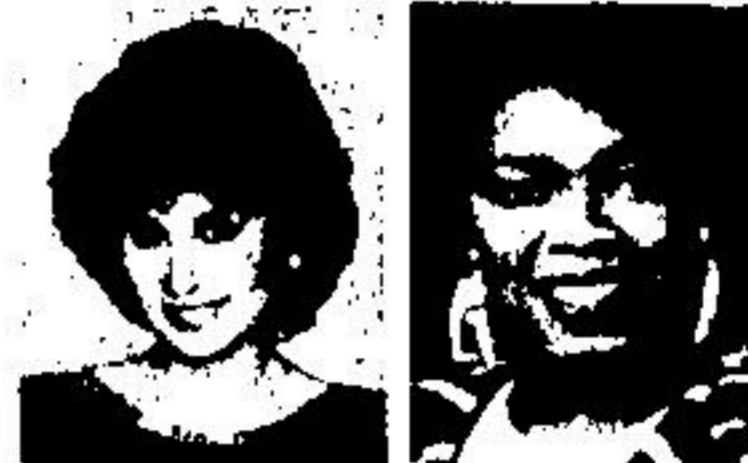
Stefanie Powers Oprah Winfrey

Q. We are fans of the TV program "Full House." There is a gap we can-